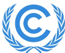
EXHIBIT ORGANIZER'S HANDBOOK