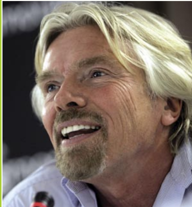
Anders Fogh Rasmussen Prime Minister of Denmark, host of the UN COP15 Conference in Copenhagen 2009

"As business leaders, we have to commit ourselves to solving what I consider to be the biggest challenge ever. I believe in our resourcefulness and in our capacity to come up with workable solutions to the problems we have ourselves created. Necessity is the mother of all invention."