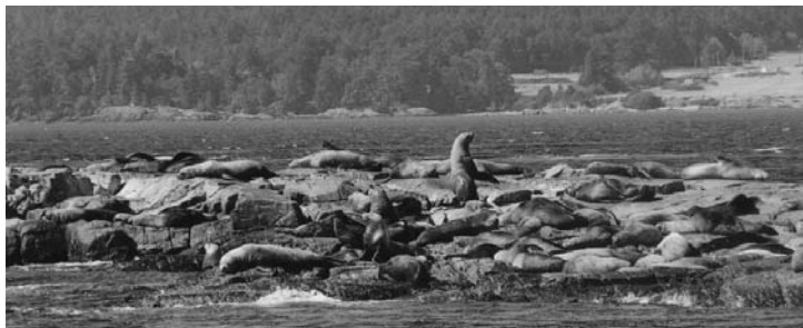
SEA LIONS • BETH CRUISE