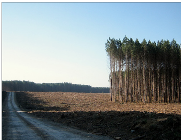
Santa Caterina Forest, Brazil.

form of grants). UREDDs would be non-tradable registerable units, each representing one tonne of verified emission reductions or removals from eligible REDD+ activities. A share of UREDDs could potentially qualify to generate certified REDD units ("CREDDs"), which are defined as tradable intangible rights. In contrast to UREDDs, CREDDs can be used as offsets for compliance both domestically (in the event of future state and municipal targets), as well as internationally (e.g. under foreign emissions trading programs or to assist in the achievement of a country's GHG reduction commitments under the UNFCCC). A REDD committee would be responsible for determining the quantitative and qualitative criteria for the generation of CREDDs 24 .