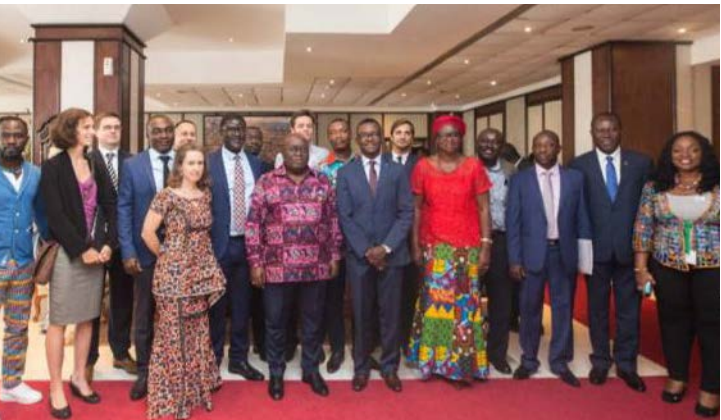
The President of Ghana, H.E. Nana Addo Dankwa Akufo Addo together with some selected participants