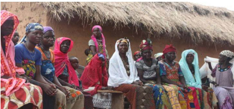
Excerpts from REDD+ Roadshow 2014