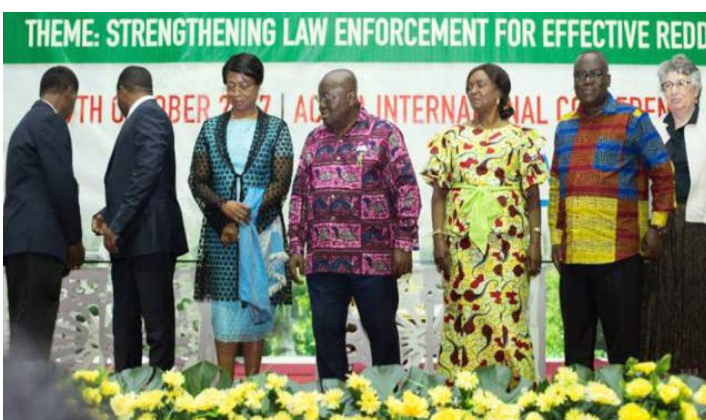
The President of Ghana, H.E. Nana Addo Dankwa Akufo Addo together with the current and former Chief Justice of Ghana