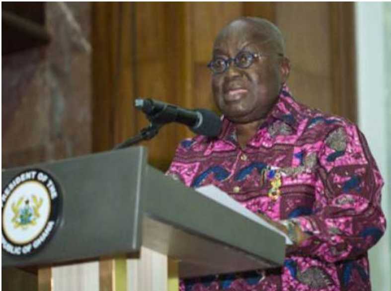
The President of Ghana, H.E. Nana Addo Dankwa Akufo Addo at the 2nd National Forum

note Address on the theme "Conserving our forests for better lives and a better climate". The 2nd National REDD+ Forum was held on October, 2017. The Special Guest of Honour was His Excellency Nana Addo Dankwa Akufo-Addo; President of the Republic of Ghana, who delivered the Keynote Address on the theme "STRENGTHENING LAW ENFORCEMENT FOR EFFECTIVE REDD+ IMPLEMENTATION", to highlight the critical role that law enforcement plays in the management of forest and wildlife resources.