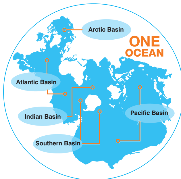
FIGURE 1 There is only one ocean. The ocean is an immense interconnected and heterogeneous whole that provides immeasurable benefits to humanity and the planet

The ocean is an immense interconnected and heterogeneous whole that provides immeasurable benefits to humanity and the planet. It is modulated by a range of physical oceanographic processes, as well as by wind, solar heating, and precipitation. These processes include the thermohaline circulation system on a large scale and more localized coastal currents that are influenced by geomorphology, weather, and tidal conditions. The ocean also comprises a