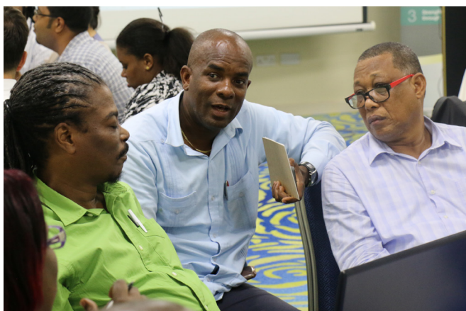
Colleagues at a Caribbean NAP Assembly in October 2016.