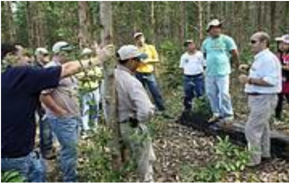
Participants of the REDD readiness field dialogue in Belém, Brazil