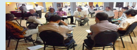
The CGE regularly conducts capacity – building workshops