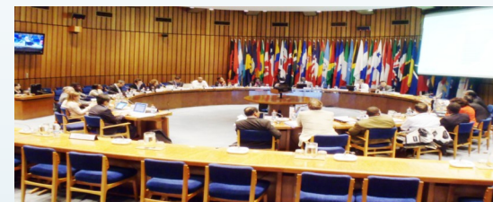
The CGE was reconstituted by decision 5 / CP.15 for the period 2010–2012.