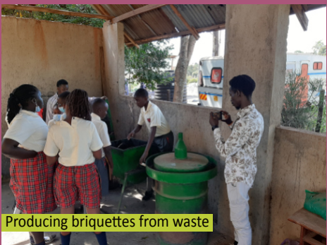
Producing briquettes from waste