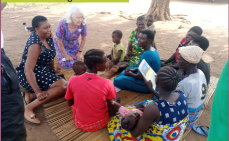
Women sharing information