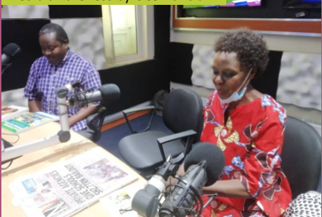
Media awareness by UCSD and JEEP