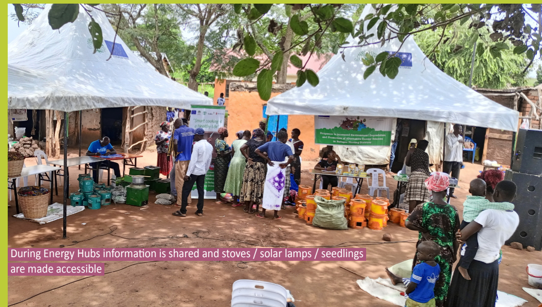
During Energy Hubs information is shared and stoves / solar lamps / seedlings are made accessible

All in cooperation with trained trainers, community-based organisations, local government officials and politicians