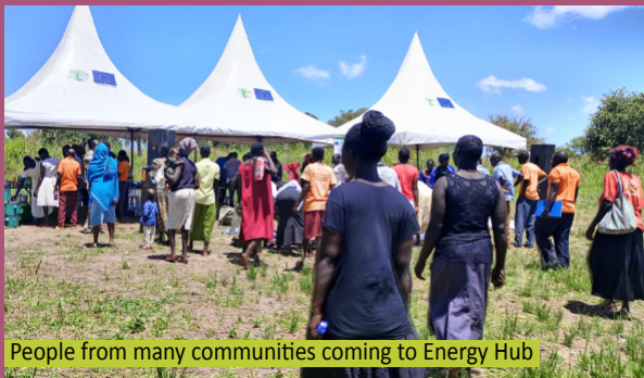
People from many communities coming to Energy Hub