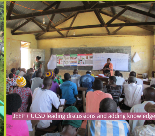
JEEP + UCSD leading discussions and adding knowledge