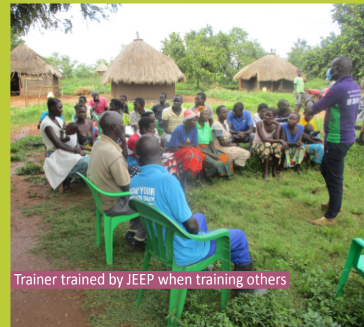
Trainer trained by JEEP when training others