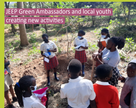
JEEP Green Ambassadors and local youth creating new activities