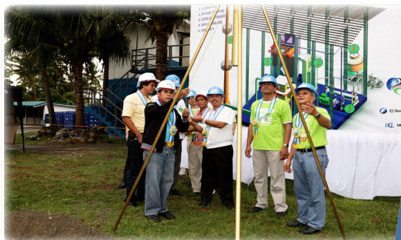
Breaking ground on a biomass cogeneration plant in La Union Province, the Philippines (May 28, 2010)

▲ CTI PFAN has helped SURE achieve financial closure for two of the six biomass-to-power projects including rice mills, food, wood and coconut-based industries that SURE promotes and continues to support in financing the remaining projects. Pepsi Co. Philippines is an off-taker for one of the closed project in which electricity and heat are generated through gasification of rice husks.