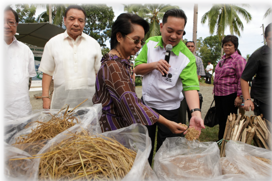
Former Philippines President Gloria Macapagal Arroyo at the launch of the ASEA One project (December 7, 2009)

Company: ASEA One Power Corporation Location: Banga, Aklan, the Philippines Project Type: Biomass Investment Secured: USD 30 million Energy Capacity: 12 MW Annual GHG Mitigation Potential: 40,000 tons