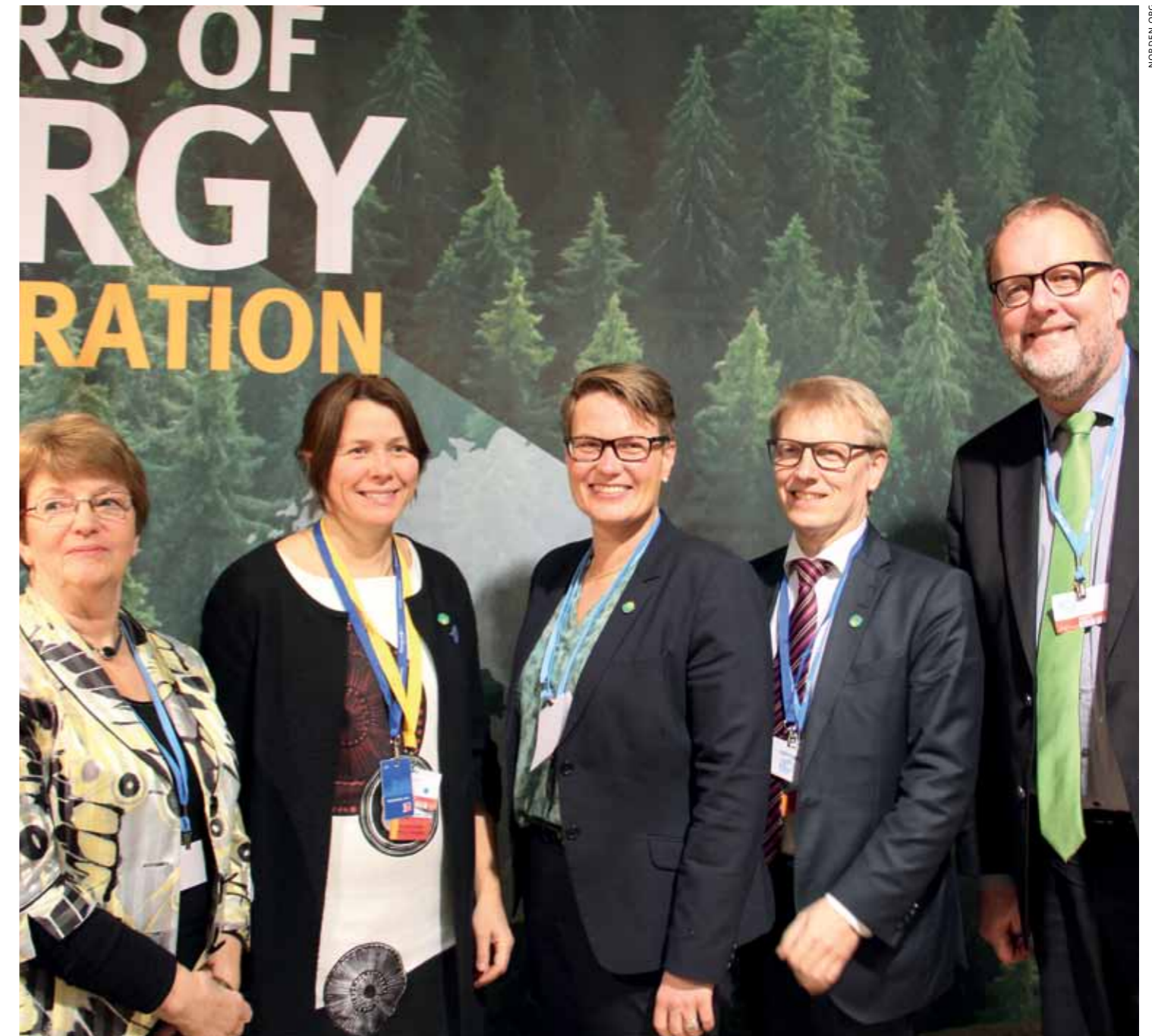
The Nordic Ministers of the Environment at the Nordic Pavilion at COP21 in Paris.

Building Bridges to the Future is one of two special papers prepared for NEFCO's 25th Anniversary event to be held in Oslo on 12 April 2016. The other is entitled "A Nordic Perspective on Green Growth".