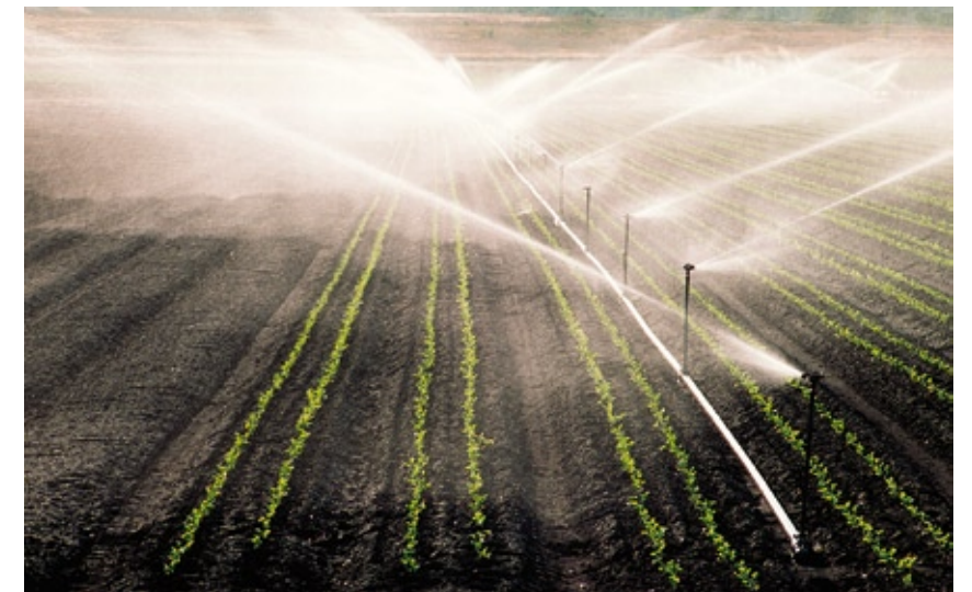
Irrigation of farmland. Droughts are expected to increase in the Southern hemisphere as a result of climate change.

Indications of interest should be sent to: → ncf@ndf.fi