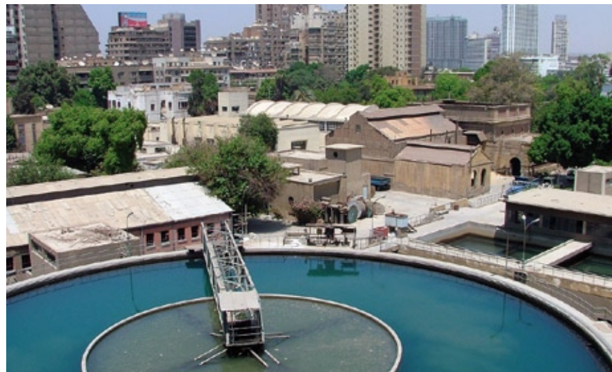
Providing clean water is one of the key areas of the Nordic Climate Facility.