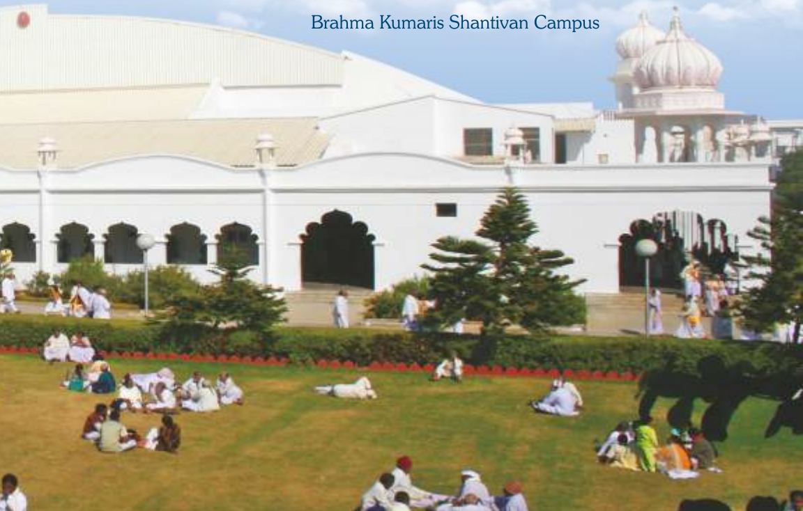
Brahma Kumaris Shantivan Campus

Brahma Kumaris is an international non-governmental organization (NGO) of the United Nations, in general consultative status with the Economic and Social Council (ECOSOC). It is also affiliated to the UN Department of Public Information (DPI) and is an accredited observer organization to the United Nations Framework Convention on Climate Change (UNFCCC) and the United Nations Environment Program (UNEP). The organization's work in human and social values allows the Brahma Kumaris to contribute an ethical and spiritual approach to global concerns.