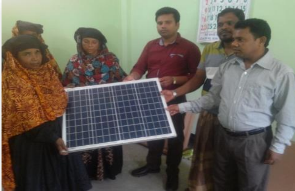
Home Solar System