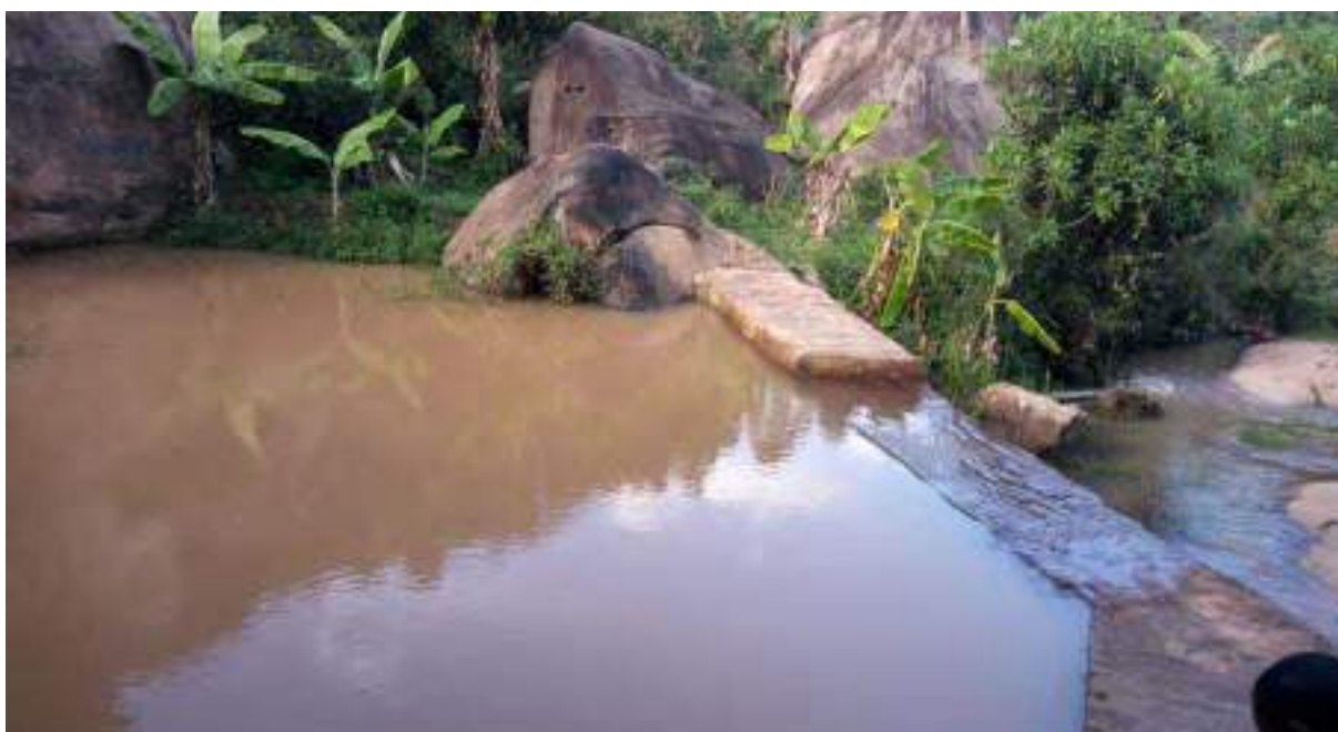
The Kya Aka sand dam in Kenya