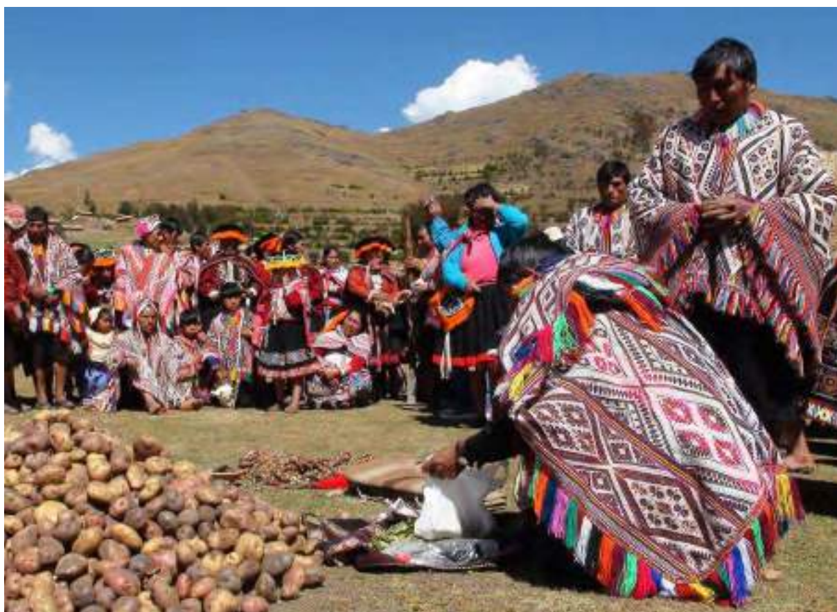
Mountain communities celebrating National Potato Day in Peru.

Engaging with mountain communities in rural areas can be challenging for cultural and historical reasons. Mountain peoples often belong to indigenous or traditional cultures with different languages, dialects, worldviews and values, and tend to be economically and politically marginalised. Hence it may be necessary to work with local NGOs and CBOs trusted by the community, spend time building trust and mutual understanding, and follow local etiquettes. Community priorities and worldviews should be discussed, as well as key project concepts like EbA and ‘ecosystem services’. Equivalent local concepts should be sought where possible and used to frame the EbA process. For example, the Andean worldview is represented by the ayllu concept, which consists of three realms: the wild, the domesticated and the spiritual, which have to be in balance to achieve well-being – ecosystem services can be explained in relation to these three realms.