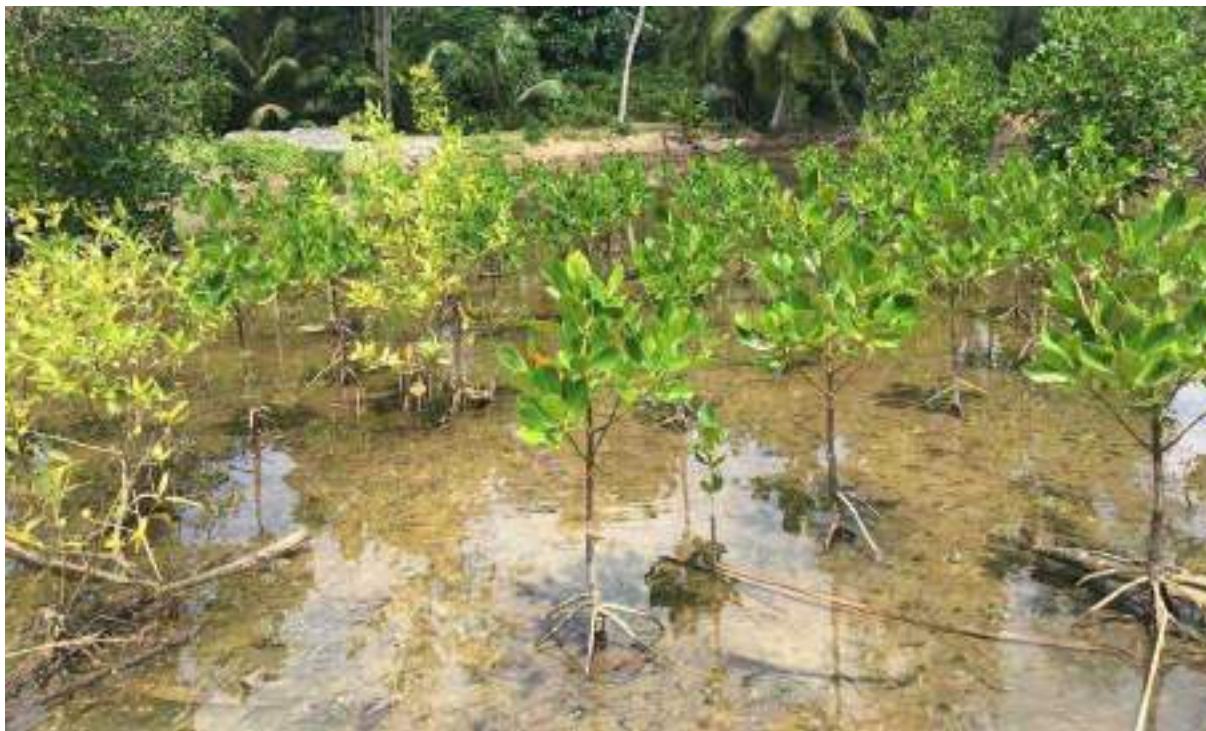
Mangrove restoration in Seychelles.