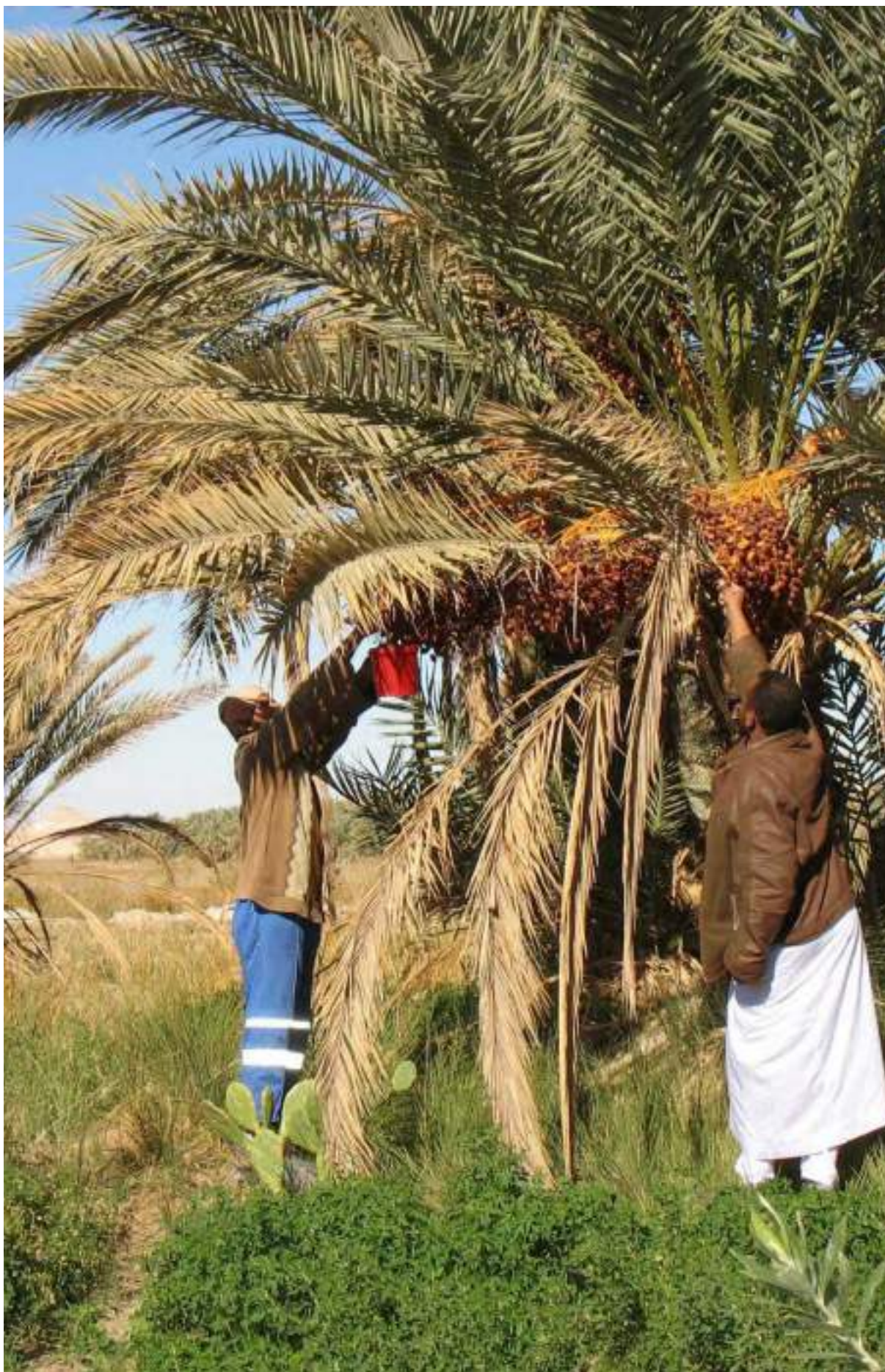
Hand-picking dates from a date palm in the Siwa Oasis, Egypt.