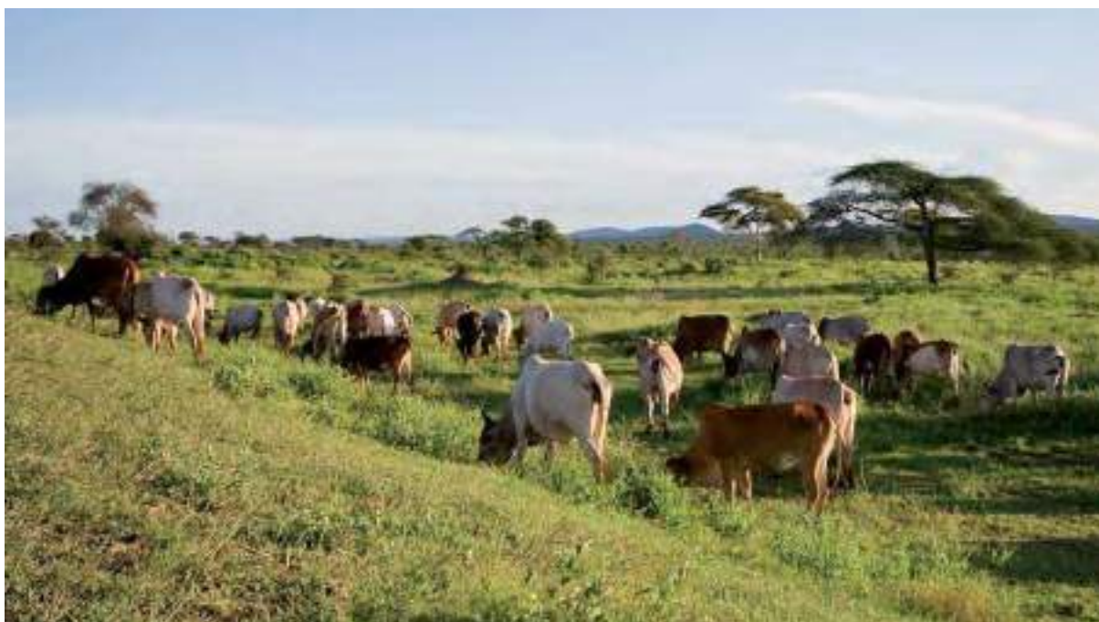
Wet season grazing in southern Ethiopia.

In drylands, annual rainfall is generally low, highly variable in time and space, and there are high evapotranspiration rates due to sunshine and wind. This means that unless stored underground, water evaporates quickly. Climatic variability is often extreme, involving droughts, floods, heatwaves and sudden downpours. Yet the comparative advantages of these environments and the role of pastoralism as a major livelihood and driver of EbA in the drylands have often been overlooked. In terms of gross domestic product (GDP) and other development indicators, drylands include both the richest and poorest parts of the planet, and also some of the most intractable and violent areas of conflict.