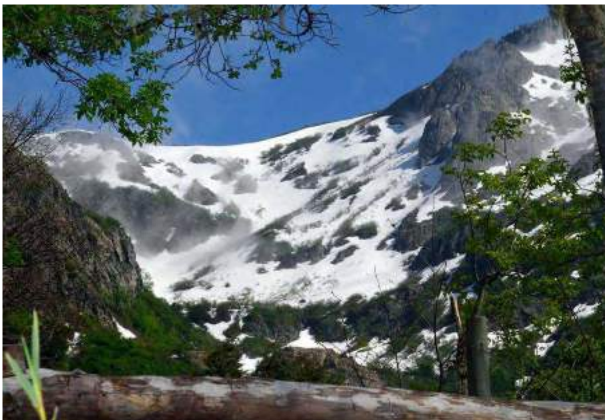
Biosphere Reserve Corredor Biológico Nevados de Chillán-Laguna del Laja – Chile (EPIC's project site).

The goal of the EPIC project was to promote the conservation of ecosystem services within the national policies and programmes for disaster risk reduction and climate change. As part of the first components, the project explored the role of good forest ecosystem management in reducing the risk of avalanches and landslides. It generated evidence of the role of forest ecosystems in DRR and climate change adaptation through a study on the quantification and improvement of the protective capacity of forests against snow avalanches. The study involved dendrochronological sampling (tree-ring dating), the reconstruction of spatio-temporal patterns of past events, reconstruction of avalanche run-out zones based on dendrochronological data and available records, and avalanche simulation with rapid mass movements (RAMMS) computer modelling (flow height). The project also explored local perceptions on forest ecosystem services, climate change and local risks from natural hazards. The results were used to position ecosystem-based disaster risk reduction (eco-DRR) at national level through multi-stakeholder dialogues. EPIC was implemented by IUCN, in collaboration with the Ministry of Environment (and its Regional Secretariat in Biobío) and the Swiss Institute for Snow and Avalanche Research (SLF), with support from the Regional Government of Biobío. 13