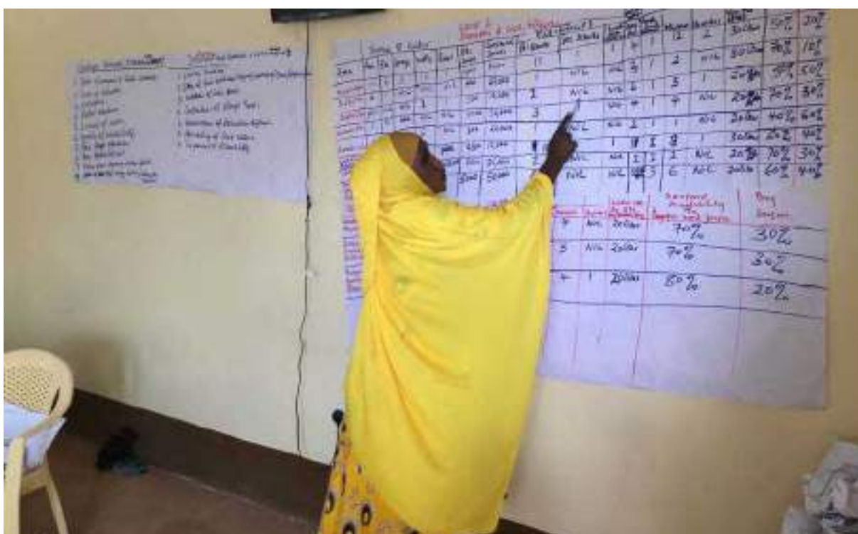
Participatory mapping and database development for strategic planning in Isiolo County, Kenya