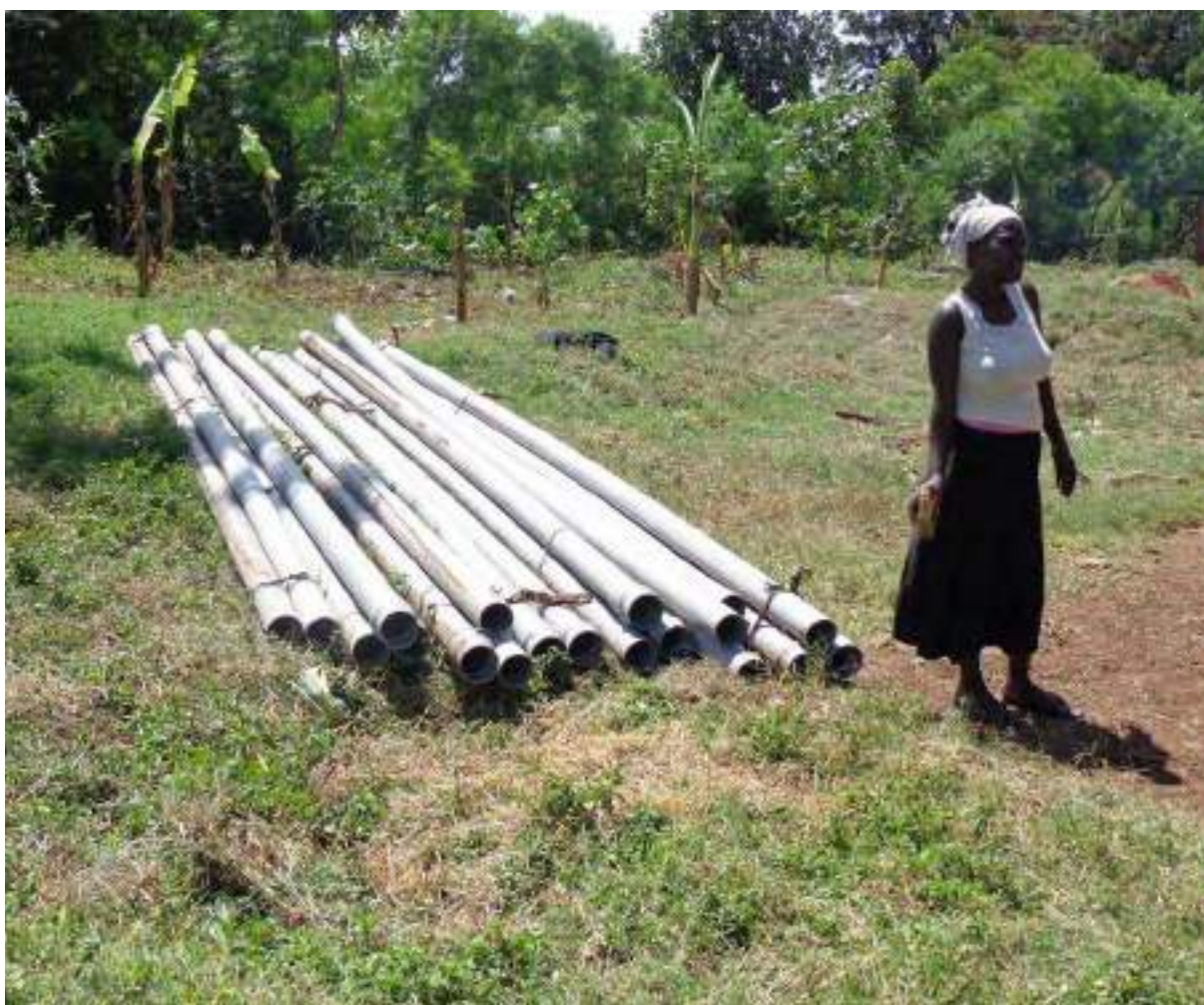
Sanzara Gravity Flow Scheme.

These were analysed based on population growth, and changes in future supply of ecosystem services due to climate change. This was modelled using the future distribution of species considered key for such services. Socio-economic characteristics were also examined as these can influence the vulnerability of a population and its ability to adapt to future changes, including percentage of poverty, dependence on ecosystems, medical service coverage and level of education.