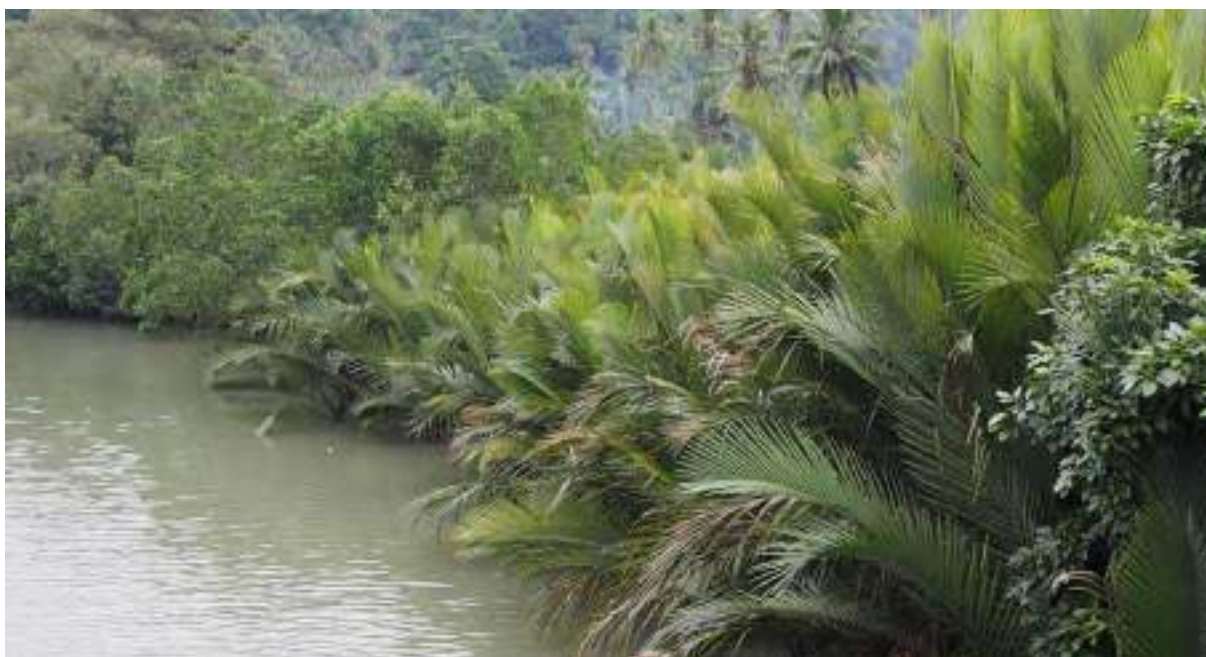
Mangrove ecosystem in Mindanao, the Philippines.

But mangroves are threatened by both climatic and non-climatic threats. Climate change impacts have already resulted in either the loss or degradation of 35 per cent of mangroves worldwide (Doney et al. 2012). Mangroves can be damaged by sea-level rise, increased levels of salinity and temperature, land erosion, and more intense storms and flooding. If mangroves cannot keep up with sea-level rise, they can leak some of their stored compounds which will emit more greenhouse gases to the atmosphere (Wong et al. 2014). Restoring and conserving mangrove forests can be done in a range of ways such as reducing non-climate pressures (eg pollution) and encouraging higher temperature and salinity tolerant plant species (UNEP 2016).