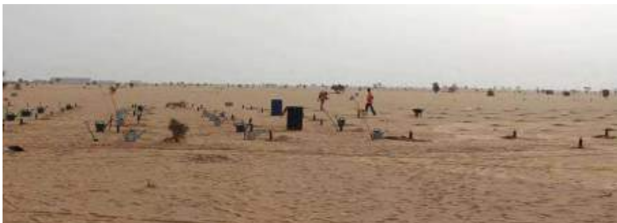
Combating sand encroachment in Mauritania.

In recent years, dryland crop scientists and practitioners have explored in situ conservation techniques which make use of the natural gene banks in the ecosystem (inside soils, plants and animals). This is a practical way to implement ecosystem restoration with resource users, using tried and tested plant and animal varieties that local people know how to raise, process and market (Nabhan 2007). In desert areas, naturally occurring oases can be cultivated using manure from livestock to enrich the soils and support a wide array of sensitive species. Once date palm trees are established, their shade improves living conditions for other plants and animals and they can also provide useful building materials, fuel and other services for human settlements (see Box 6).