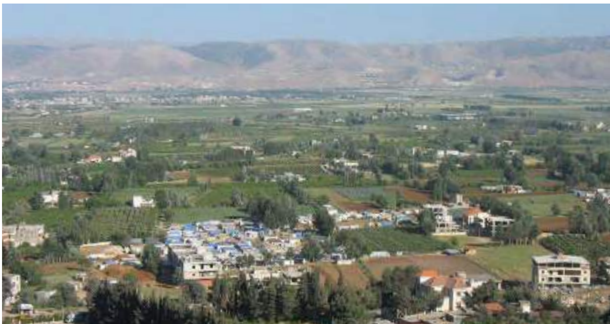
Bekaa Valley, Lebanon