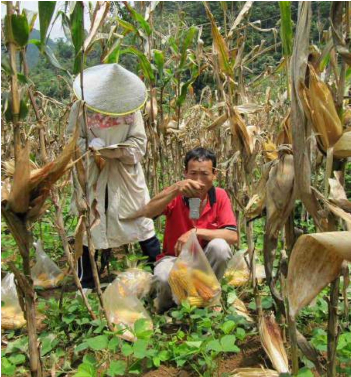
Participatory plant breeding in Southwest China.

Local varieties are often highly resilient. For example, maize landraces survived the big spring drought in Southwest China in 2010, while hybrid maize did not. PPB also supports diversification to reduce risk by raising farmers' and breeders' awareness of the importance of conserving genetic diversity and improving the yield and quality of local varieties. PPB is more cost-effective than conventional breeding and faster (Ceccarelli 2009). The time varies depending on the crop (eg 2–4 years for maize).