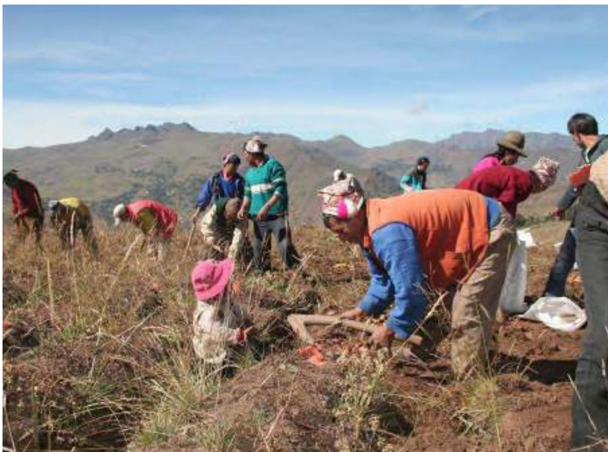
The Potato Park, Peru where adaptive management and potato diversification has increased productivity.

The park has strengthened traditional biodiverse agroecological farming practices across the landscape. It has revitalised the holistic Andean worldview, customary laws and cultural and spiritual values which promote conservation and equity values. It has created strong local ownership and community pride in their park – an evolving gene bank for local, national and global adaptation. These impacts will ensure long-term sustainability but have taken time to build – 5–10 years of sustained and flexible support for highly participatory action research processes.