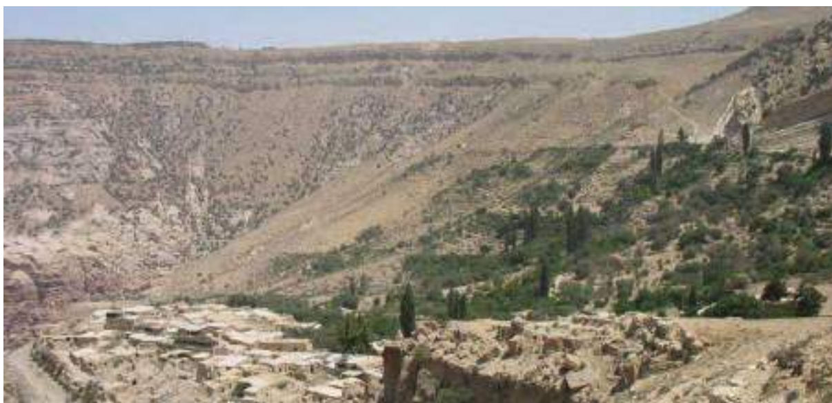
The village of Dana in the Dana Biosphere Reserve, Jordan.

Participatory network mapping has been applied in many different ways in dryland contexts to visualise and explore actor linkages (eg Mayers 2005, Schiffer and Hauck 2010, Stein et al. 2014). The simplest tools have often proved to be the most effective – but their effectiveness depends on the attitude of the facilitator and his or her ability to build a rapport among the group. For example, in a social network analysis in the Blue Nile, Ethiopia, relationships between different stakeholders (different government authorities, donors, NGOs, enterprises etc) were mapped visually to generate narratives about the interplay among actors and discuss their implications for ecosystem management (Stein et al. 2014). EbA project steering committees should bring together different stakeholders, particularly local communities and local government, to co-define project goals (see Box 8).