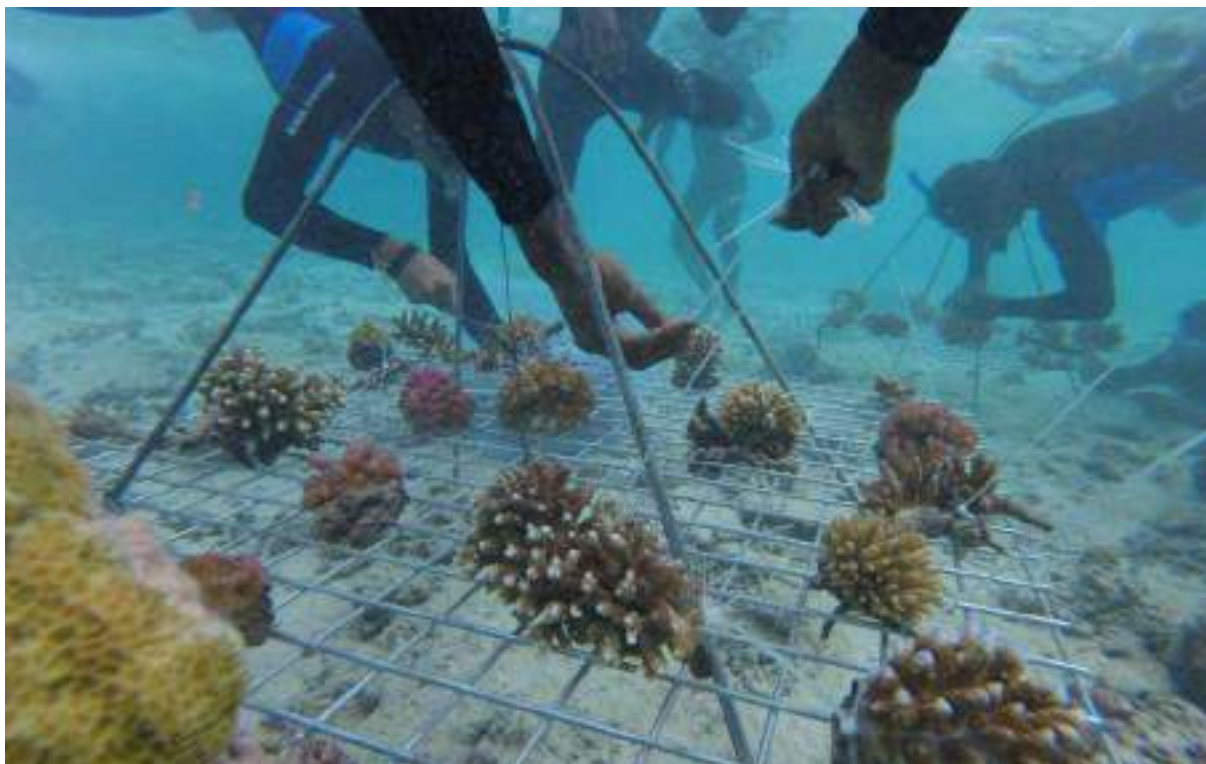
Coral gardening