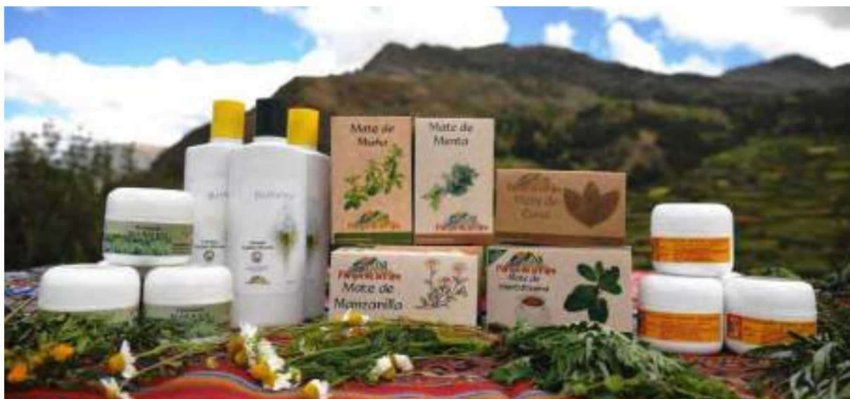
Landscape-based products and services for livelihoods diversification in the Potato Park, Peru.

The Potato Park microenterprises are largely made up of women, who are generally poorer and more vulnerable than men. Ten per cent of the revenue from microenterprises is invested in a community fund and distributed equitably to communities based on their contribution to sustainable management. The fund also provides a safety net for the poorest people (eg widows and orphans). An inter-community agreement for benefit sharing guides the distribution of funds based on customary laws. Sustainable management of the Potato Park landscape also helps to ensure water provision for downstream populations, including the city of Cusco.