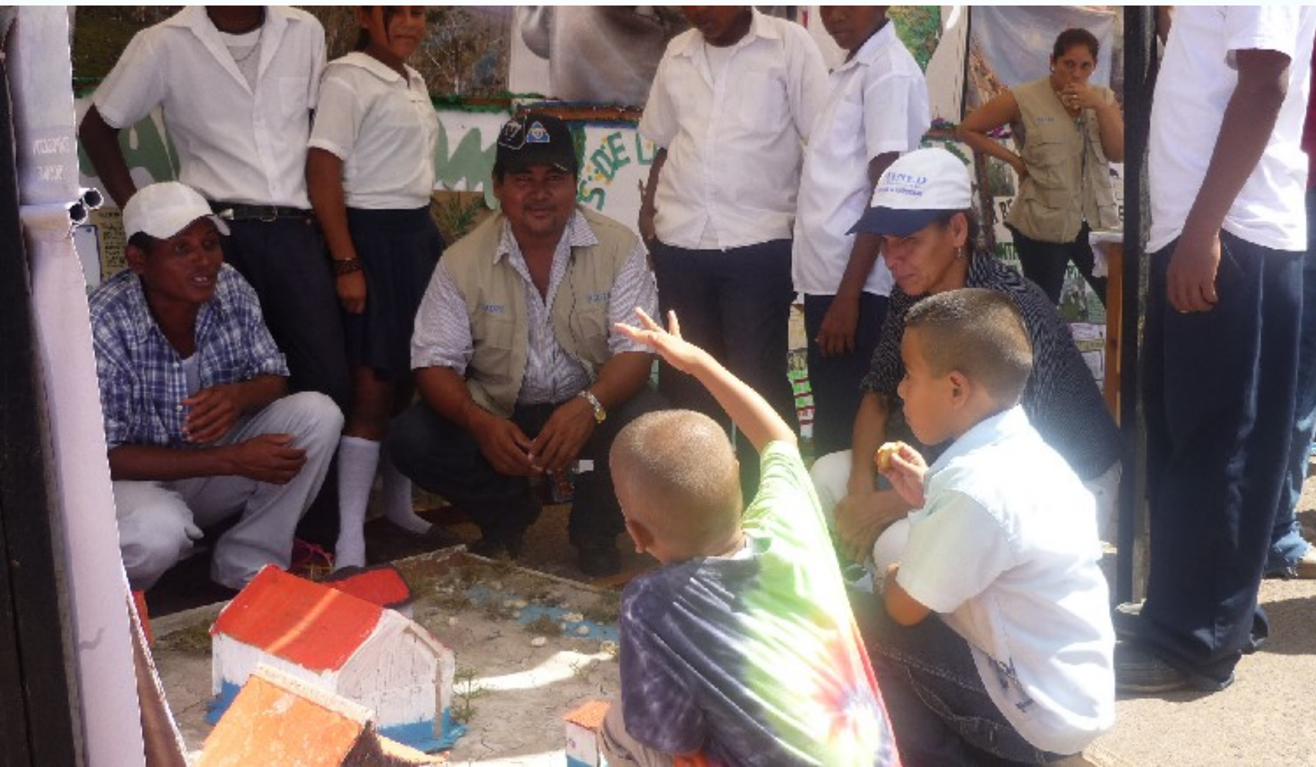
Children discussing on environment