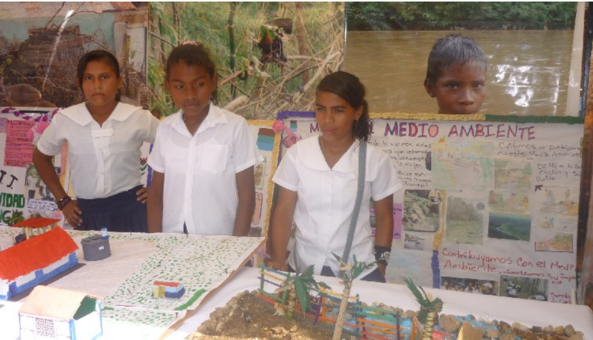
Children exposing environmental projects