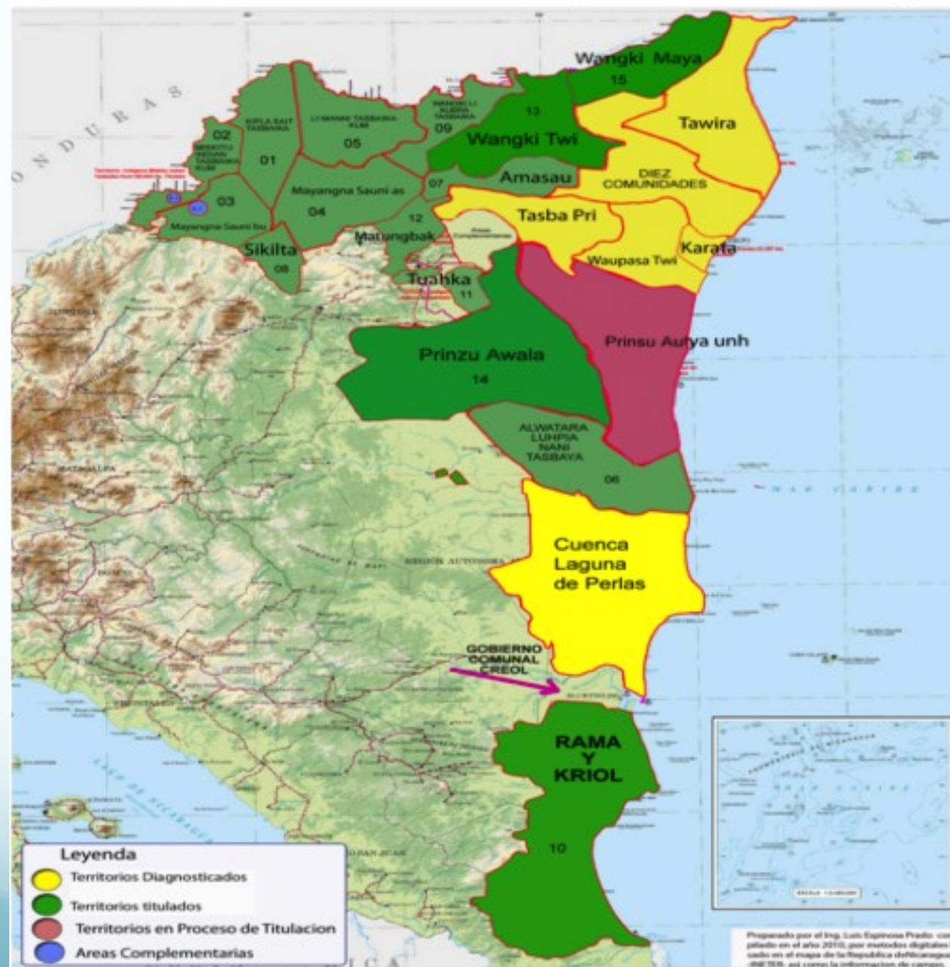
Mapa del Estado de Avance del Proceso de Demarcación y Titulación de los Territorios Indígenas