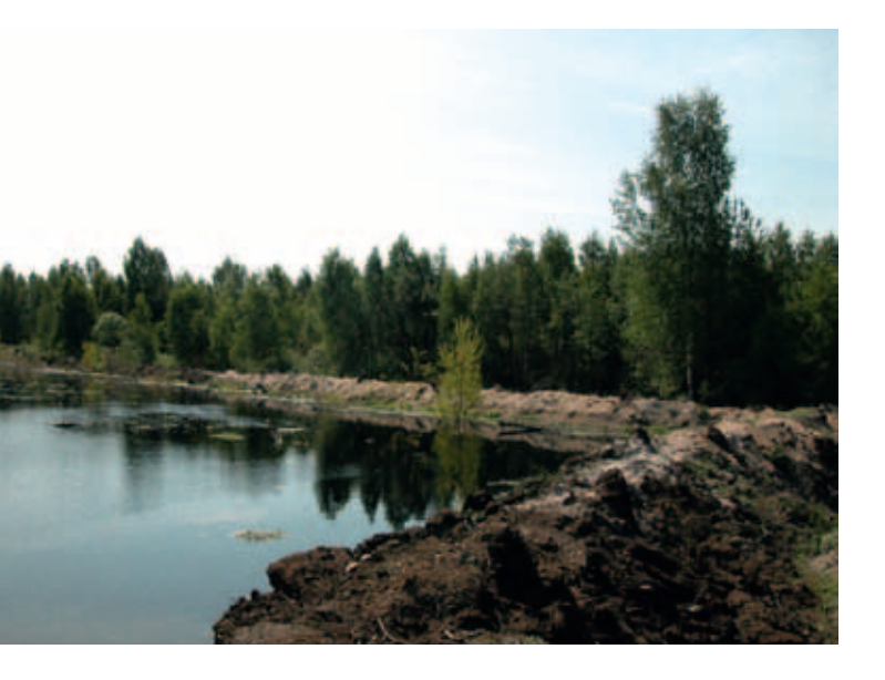
Dam preventing water to flow from the extracted peatland.

Together, the partners will provide input for the restoration and rewetting of more than 40,000 hectares of degraded peatlands; assist the Moscow oblast in the development of an inventory of peatlands areas; evaluate their fire danger status; and monitor greenhouse gas emissions.