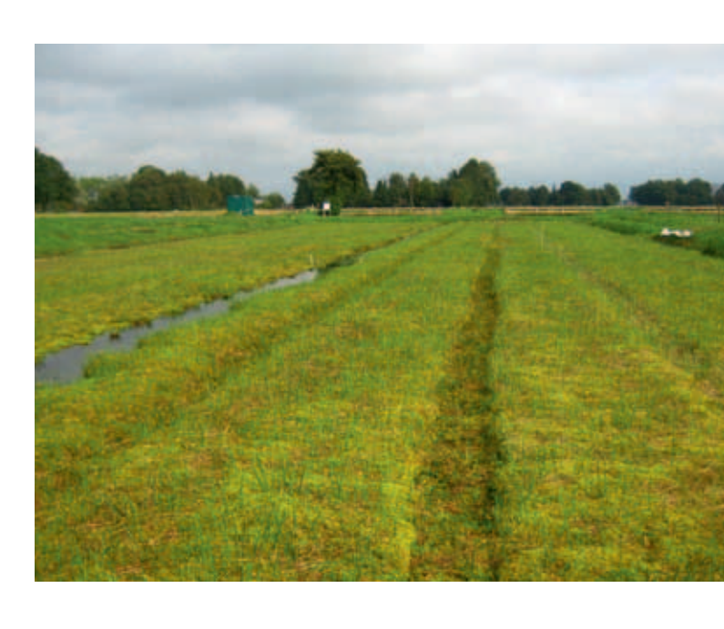
Sphagnum farming is a form of sustainable use, as done in Germany.

The partners will also develop guidelines for peatland conservation and rehabilitation, and advise on national planning and implementation of rewetting activities. Pilot business cases will be developed to demonstrate opportunities for effective mire restoration and paludiculture and for generating carbon credits.