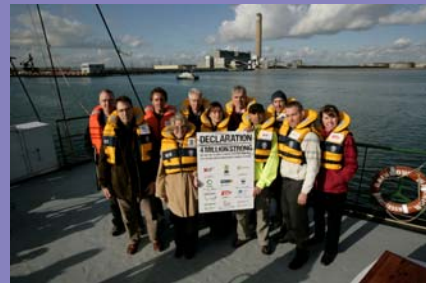
Delivering the renewable energy declaration to Kingsnorth power station