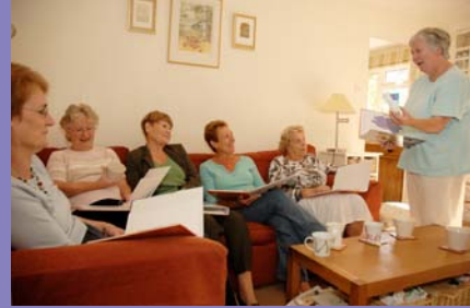
Local EcoTeam group