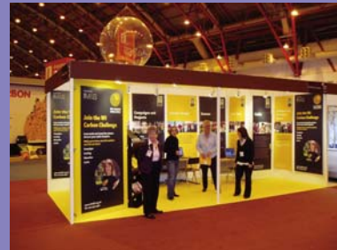
Carbon Challenge booth at the Ideal Home Show