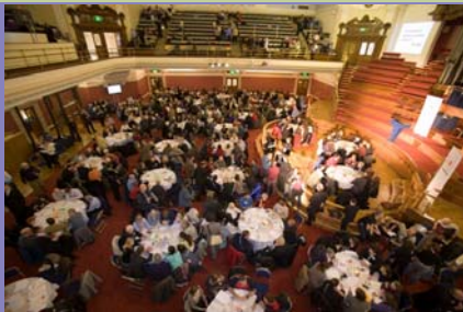
Speed dating with MPs