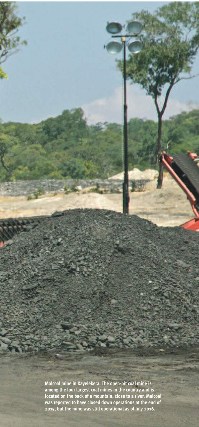
Malcoal mine in Kayelekera. The open-pit coal mine is among the four largest coal mines in the country and is located on the back of a mountain, close to a river. Malcoal was reported to have closed down operations at the end of 2015, but the mine was still operational as of July 2016.