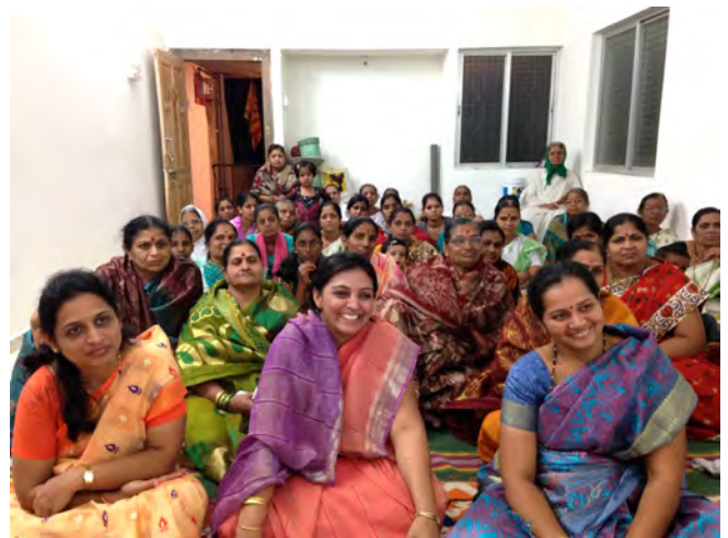
Centre in Nagav. Meeting sisters, mothers and kumaris

Later that evening we met with a group of about 40 mothers, sisters and kumaris at the centre in Nagav, to introduce yogic farming methods. They were very interested and many knew at least one person who was experimenting with SYA.