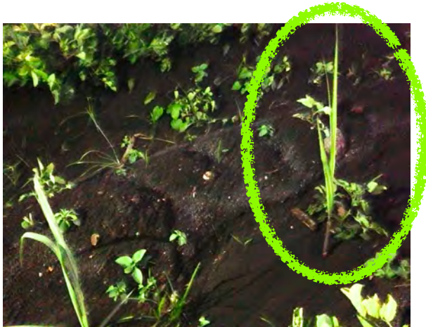
Yugic sugar cane sapling (21 days/ 20cm in height)