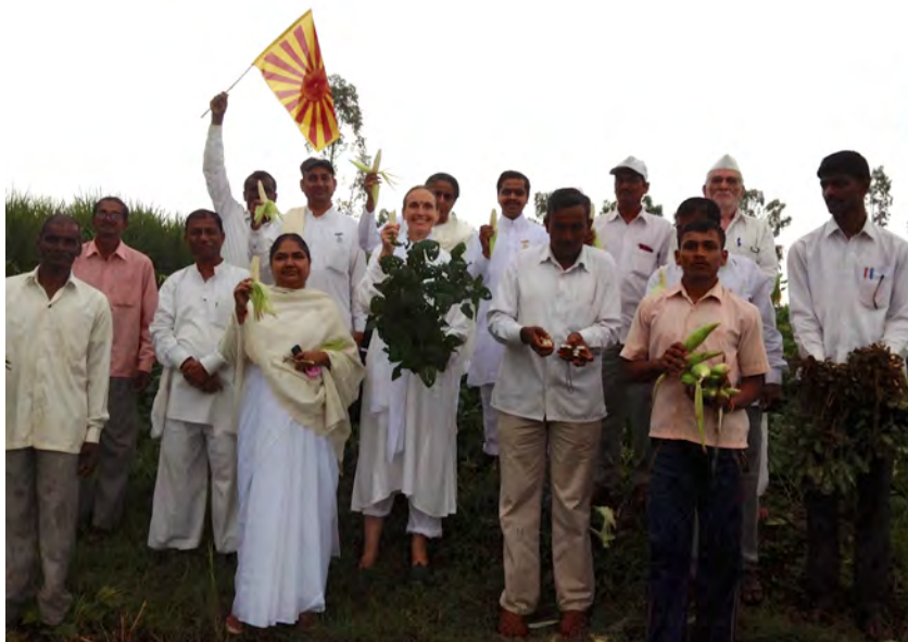
Tour group with SYA farmers. The farmer of this land, which included sugar cane, soya beans, and

processes, she feels it is a good result.