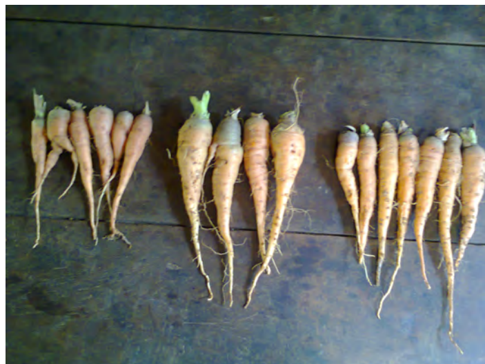
Chemical carrots (L), Yogic carrots (C), Organic carrots (R)