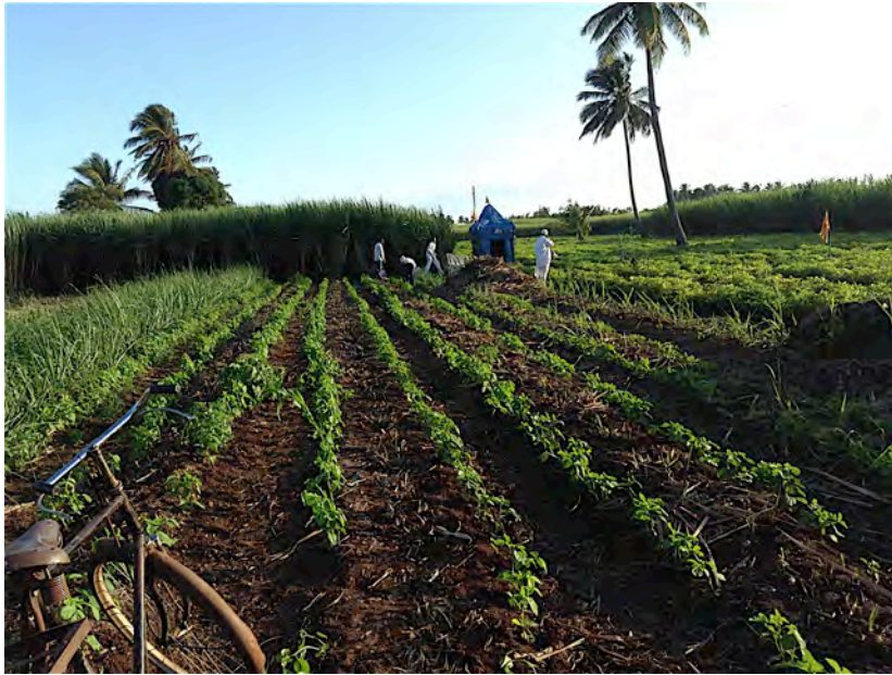
Village in Chichwad, Maharashtra. Bicycle front left - invaluable for young innovators, and meditation hut at the rear.

farming needs. Young farmers are encouraged to implement their ideas (like attaching an adjusted bicycle to a horse as a surface level plough). This increases confidence in farming communities and is bringing new workers.