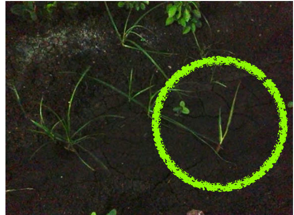
Chemical sugar cane sapling (21 days/ 6cm in height)