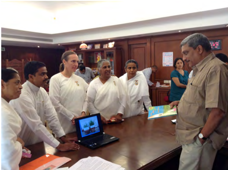
Brothers and sisters meeting with Chief Minister of Goa, presenting SYA.

We visited the Department of Agriculture, Government of Goa, and the Director and Deputy Director of Agriculture took us on a tour of SYA plots. We then inaugurated the SYA training room, dedicated for SYA training. There was a full audience and a complement of news media in attendance.