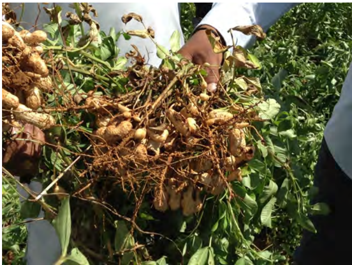
Freshly picked SYA groundnut (peanut)

We then visited a sugar cane crop being looked after by two brothers. Fortunately, we were able to contrast the yogic sugar cane with an adjoining crop of chemical sugar cane managed by the uncle of one of the brothers. The tastes of each were completely different. Both delicious, but the yogic crops certainly had an unmistakable clarity in the taste. Notably, the chemical crops were more prone to flattening during flooding than the yogic crops which remained more upright.