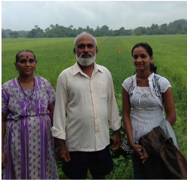
Young female farmer (R) with family members near Anjuna village. Yogic crop in background.

SYA training. We went to the training cottage and met with 9 brothers and 5 mothers, all of whom are learning SYA methods... The sisters say that there is a bird who flies in whenever sisters are reading murli and teaching SYA. He flew in when we were there and circled around the head of each of us in turn!