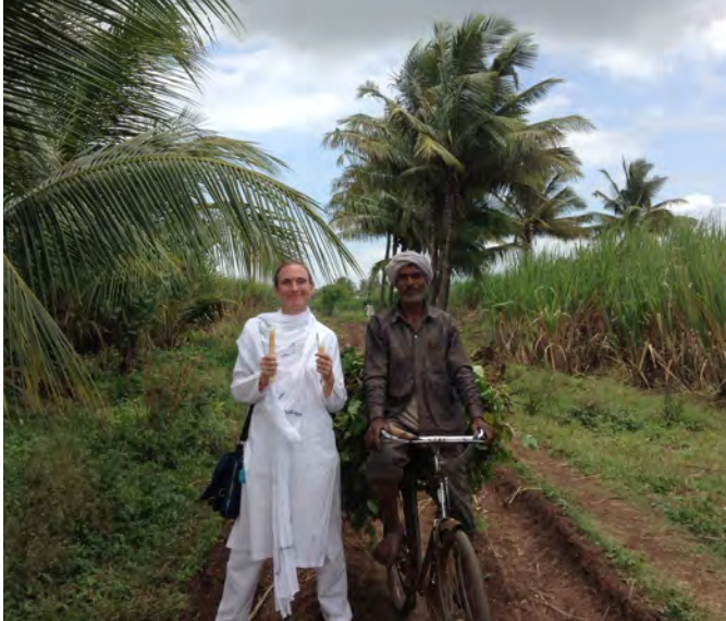
Standing next to assistant farmer, with sugar cane in hand, undertaking a taste

After lunch we visited the farm of a brother who grows banana crops. Banana crops in that area had been unseasonably dry, including the SYA crops. The difference was that the SYA crops appeared markedly less affected by the lack of water than the neighboring chemical banana crop. Other farmers also reported that SYA crops have better water retention than either chemical or organic crops.