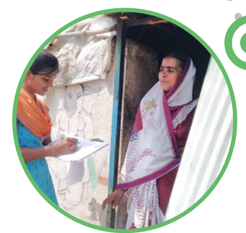
Phase 3 - Suicide Behaviour Management