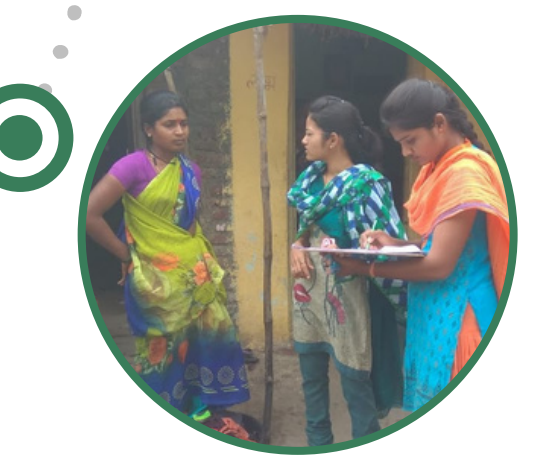
Phase 2 - Detection of the Risk of Suicidal Behaviour