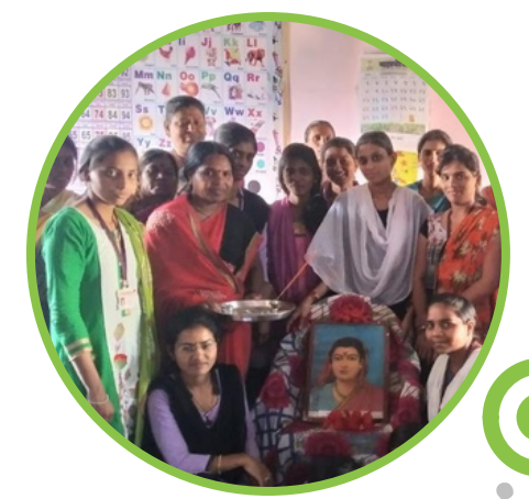
Phase 4 - Training

In this phase, training programs aimed at the prevention of suicide and suicidal behaviour management will be conducted – yoga, medication, community activities, etc. Even after the project's completion, the community engagement program shall continue through the establishment of the focus group consisting of local authorities, volunteers and self-help groups who will continue to engage the community by conducting happiness programs and monitoring the process.