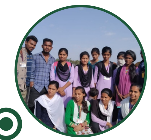
Phase 1 - Positive Promotion of Mental Health and Prevention of Suicide

approx. 8,500 farmers died of suicide between 2016 to 2019