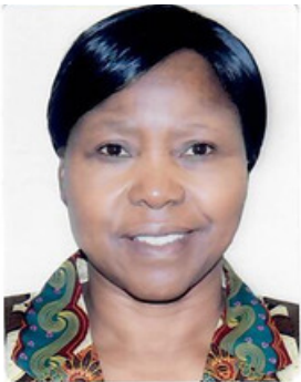
Honourable Minister Oppah Charm Zvipange MUCHINGURI-KASHIRI