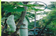
Terrace Gardens, Trivandrum