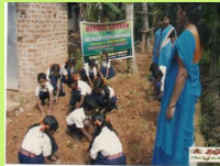
School Garden, Nedumangad