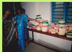
Palmyra reed products, Trivandrum