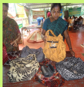
Cloth bags, Nedumangad