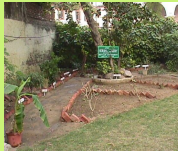
Herbal Nursery, Delhi