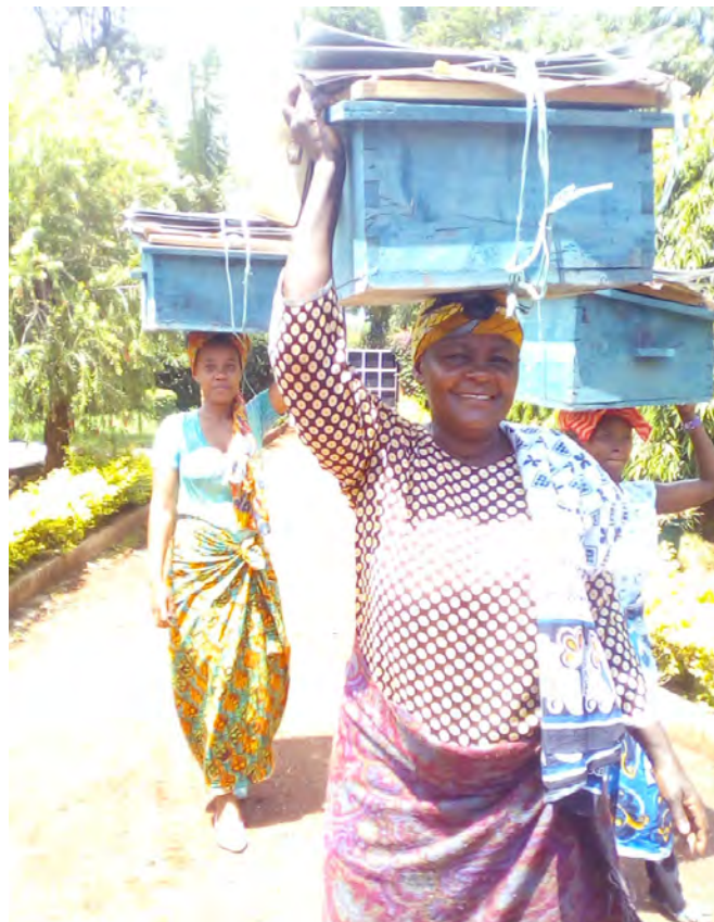
Proud owners of locally-made, solar box cookers in Tanzania, thanks to you.

helped women and children all over the world breathe cleaner air and live healthier lives with solar cooking