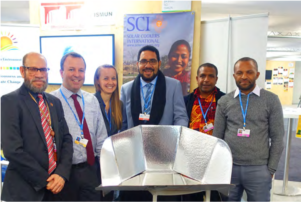
Papua New Guinea government representatives at SCI's exhibit booth during the United Nations Climate Change Conference.

“How do I get them there? I want Papua New Guinea to be solar cooking,” exclaimed the Honorable John Thomas Pundari (pictured center), Minister for Environment Conservation and Climate Change of Papua New Guinea while looking at the global map SCI created of solar cookers.