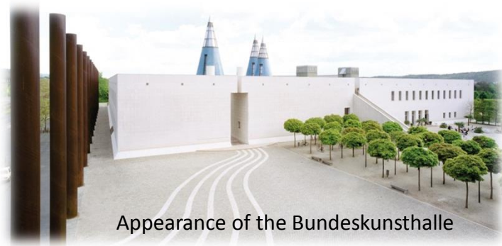
Appearance of the Bundeskunsthalle

The lounge is on the first floor of the "Halle EG /OG".