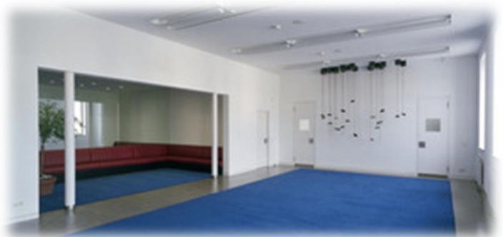
The seminar venue: Lounge, the Art and Exhibition Hall

Catering will be served for further exchange of views among the participants after the event.