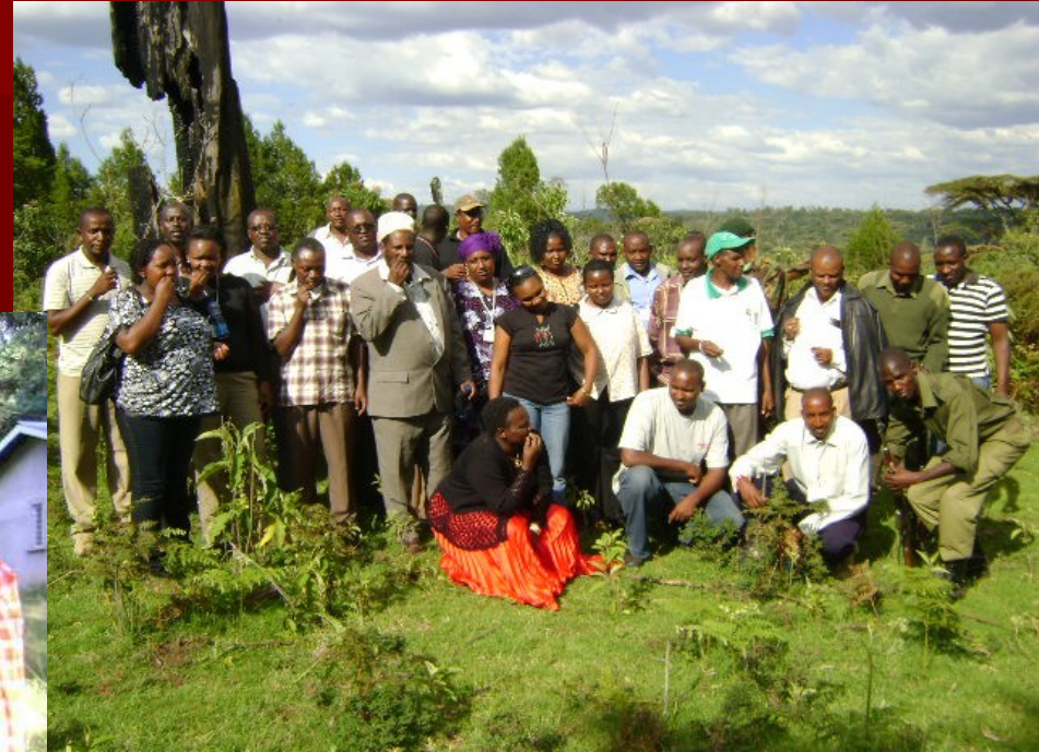
National IPs Steering Committee on CC & REDD: Visit to Mau forest