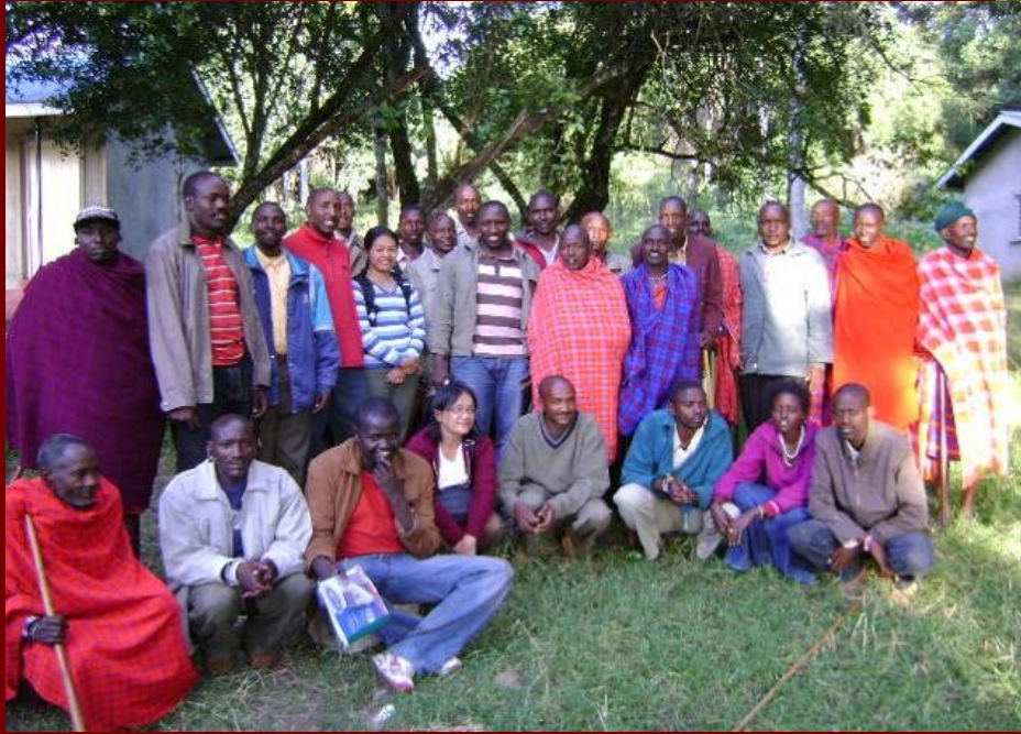
LCC, Training of local researchers at Loita