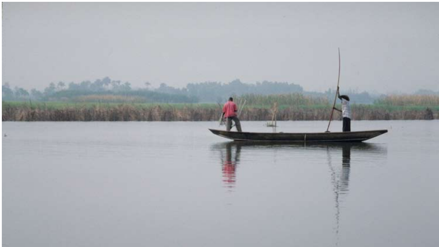
(Benin)

This stocktaking report set out to provide a comparative overview and analysis of key climate screening tools and guidance efforts to date, and to illustrate how climate risk screening supports the process of mainstreaming. We have additionally explored the concept of mainstreaming, and analyzed how key climate change adaptation and mainstreaming concepts are used and defined in relevant literature, while clarifying how they relate to development.