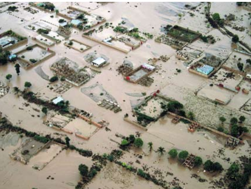
Sophia Paris/UNDP (Haiti)