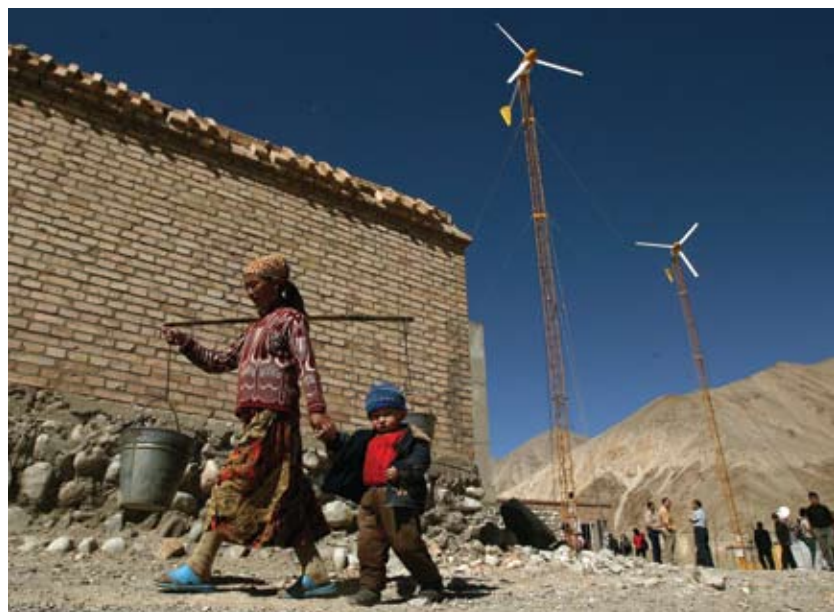
Stephen Shaver/Bloomberg News (China)

The detailed climate risk assessment leads to the identification of adaptation options (fourth item on our generic list) and prioritization and selection of adaptation options (fifth item). At the national and sectoral level, this corresponds to the inclusion of adaptation-specific programmes and projects as well as the inclusion of cross-sectoral and sectoral top-down adaptation activities.