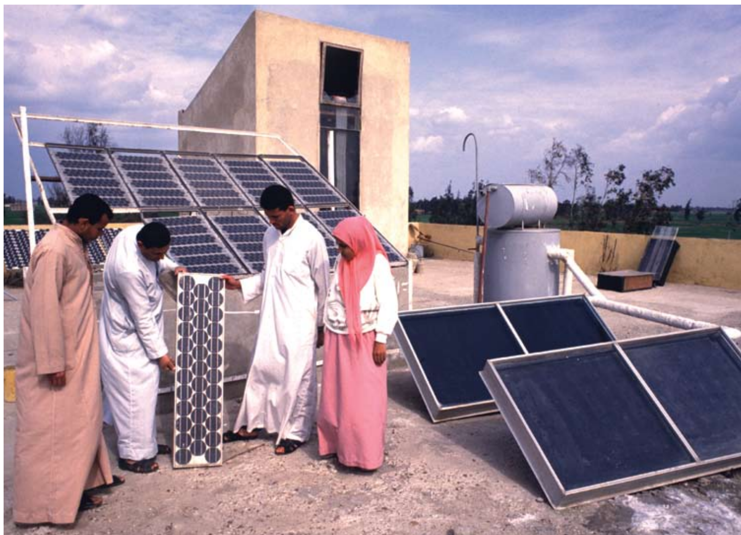
Jorgen Schytte/UNDP (Egypt)

At the same time, the table indicates that many risk screening tools take a broad range of mainstreaming aspects into account at the level at which they operate, although it should be noted that the table does not indicate how detailed the assessment of each mainstreaming aspect is. The results and experiences from the risk screening tools may therefore provide valuable information, as well as represent vehicles to support the wider process of mainstreaming across various levels and go beyond simply climate risk screening.