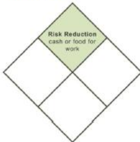
Safety Net Only