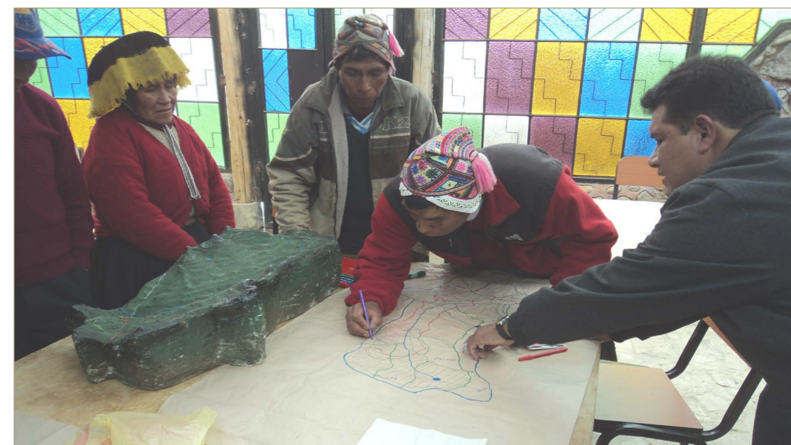
Participatory mapping with members of the Potato Park communities