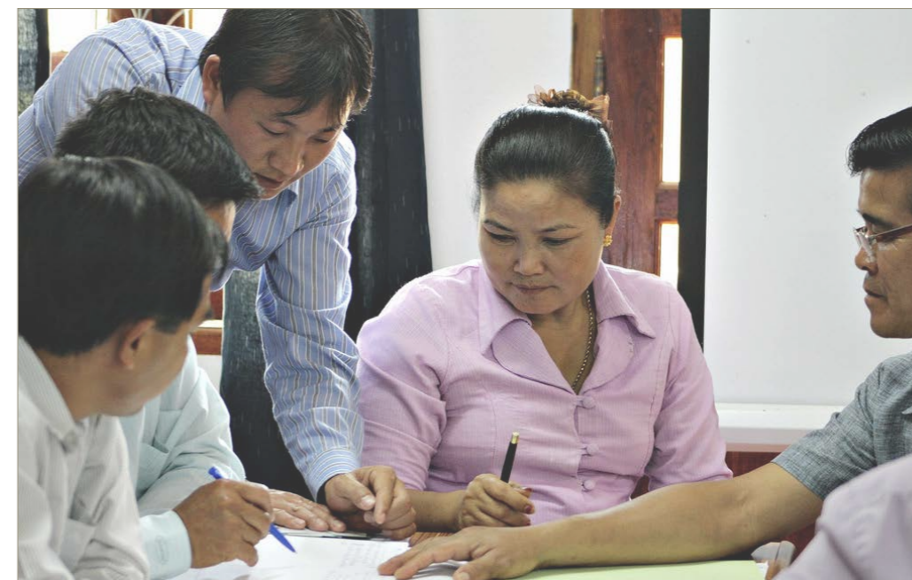
District consultation in the Mekong region

Sustainability Assessment Protocols developed by the International Hydropower Association provided a tool for initiating engagement with these groups by making hydropower management and sustainability more of a priority.