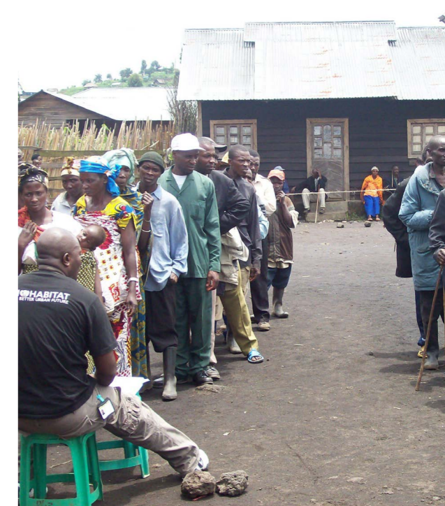
A land mediation centre in eastern-DRC

The mediation centres have, however, found it difficult to reach women. Women face cultural barriers to engaging with land debates, a problem exacerbated by the continued presence of male-dominated militias and violence against women 83 . There has been some engagement by women; two of seven local mediators at the Kitchanga centre are female, while 17% of conflicts registered at the Kitchanga centre were reported by women. Yet women struggle to participate in training workshops, particularly those that span several days and require them to stay in a different town or village away from home. There is even evidence that their travelling away from home has led to domestic violence in some cases. It is possible that mediators could play a greater role in bridging the gap between local land authorities and women, or that gender balanced mediation teams could help to include women in debates over land ownership 84 .