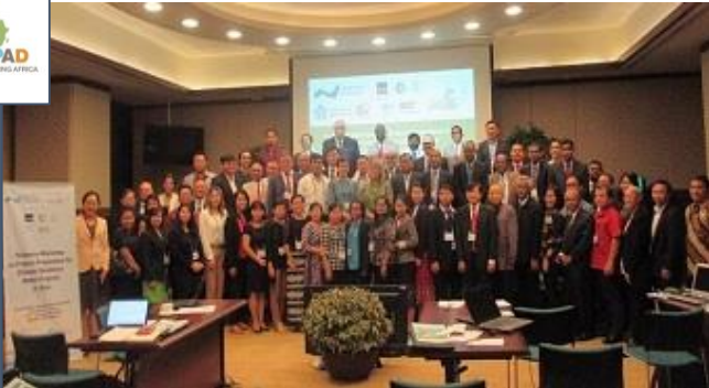
Technical Workshop on Project Preparation for Transformational Climate Resilience Water Project Concepts in Asia workshop