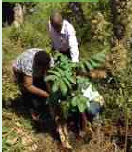
Planting trees in Kahe community forest.

materials, fuel, medicines and animal fodder. The communities have shared responsibilities to protect water sources, land resources and the forests, by ensuring that the village bylaws are adhered to and reporting to the local government offices about any environmental destruction. Despite the community efforts, they are particularly vulnerable to climate change, which is impacting their water resources. It has caused Lake Magadi in Wiri village and the River Lawate in Lawate village to dry because of a change in the pattern of rainfall and the disappearance of the nearby Kilimanjaro glaciers. ■