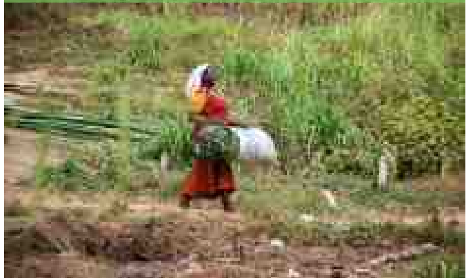
A woman carrying a bag of charcoal in Liberia.

Given the many negative impacts associated with the use of biomass in Liberia, policies are needed that give the population access to cleaner and less harmful forms of energy, and allow them to use less wood and charcoal, and in a safer way. Promoting the use of efficient cook stoves is important, but allowing people access to electricity