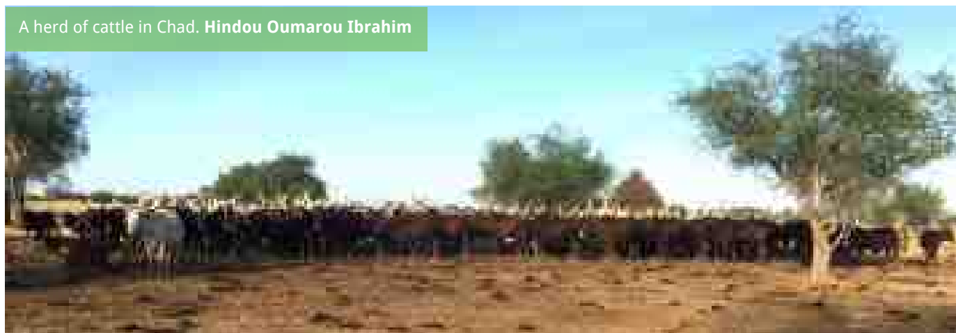
A herd of cattle in Chad. Hindou Oumarou Ibrahim

The articles that follow in this edition of Forest Cover highlight many other examples of community-based ecosystem