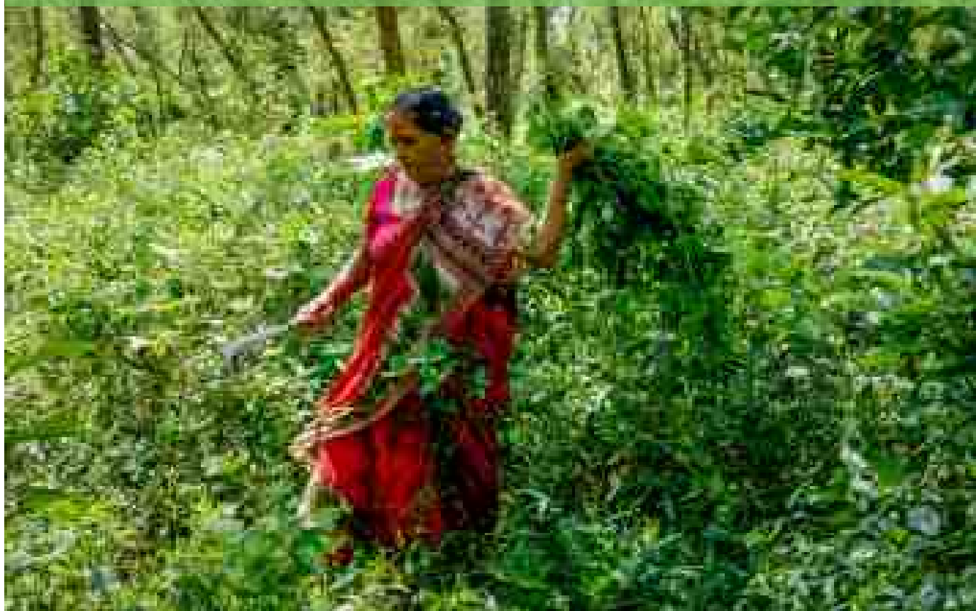
A woman from the Binayi Community Forest User Group collects green manure.

forest, religious forest, and conservation forest. Overall, community forest is the main form of forest management. Leasehold forest aims to support poor and marginalised communities by handing over forest land for their use, to support livelihoods and generate income. The religious forest is managed for religious purposes by various religious organisations. Collaborative forest is another regime practiced in the southern part of Nepal and aims to address the access of traditional users living far from forested areas. Finally, conservation forest, which is designated as national forest, is managed to conserve and protect forests which are important for culture, tradition, and scientific reasons.