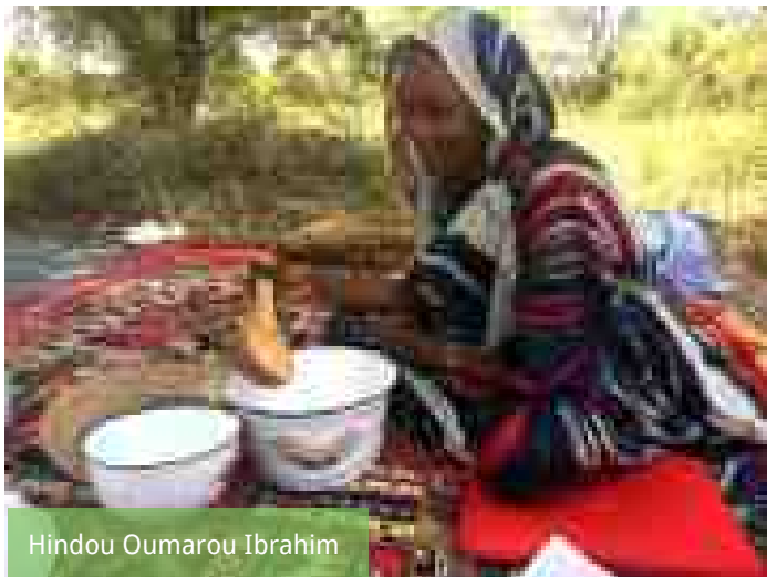
Hindou Oumarou Ibrahim

We already have most of the tools we need to successfully limit global warming to 1.5°C, and as Indigenous Peoples, we will continue to manage the ecosystems we depend on, through our traditional practices, which are the legacy of hundreds of years spent living in harmony with our environment. This is the pathway we choose. Now governments must choose whether to give adequate support to indigenous-led forest and ecosystem restoration, or to go in the opposite direction. ■