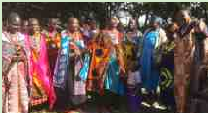
Indigenous women gathering at a community meeting in Kimintet.

Community members have identified a lack of legal protection of community forest by the county and by national laws as being a key external threat. The legal framework recognises the community forests’ role in biodiversity conservation and ecosystem services, but does not