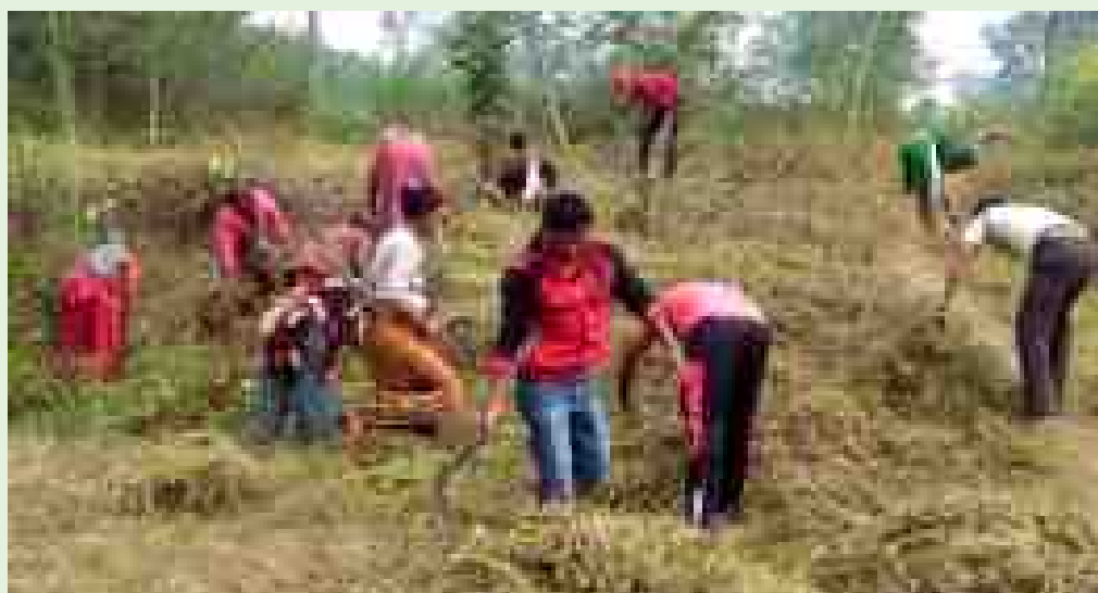
Members of a community forest user group managing their community forest in Nawalparasi district.

strong protest from local communities against this centralised decision from the government, which prioritised the protection of the forests over securing communities' tenure rights over them. The more protection-oriented provisions in the forest management plans for the community forests in these particular areas mean that the local communities are unable to exercise their rights even though they are legally held. ■