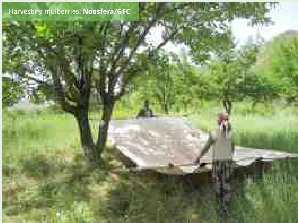
Harvesting mulberries.

The term 'feasibility' goes a long way to explaining the lack of ambition in current climate targets and pathways. The main reason countries agreed to a 1.5°C target when they finalised the Paris Agreement was that they felt a more ambitious target was not 'feasible' in light of current economic development trends. Instead of taking scientifically proven, ecological planetary boundaries and socially desired outcomes as a basis for climate policies, economic growth was embraced as a goal rather than an instrument for sustainable development.