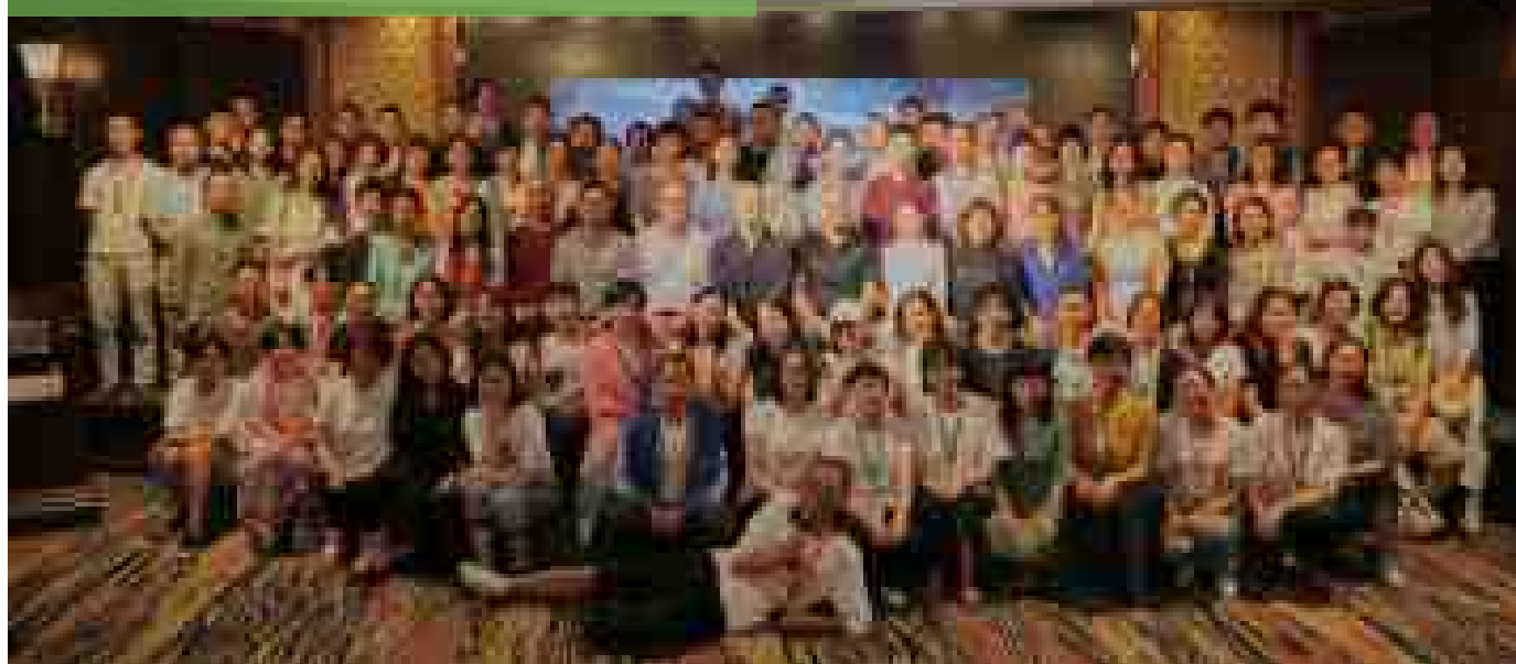
Participants at the Good Food Hero Summit 2018. Fan Liao

In the late 1970s, economic reform in China opened up the country to imported industrial food production models. Capital-intensive livestock rearing began to thrive and became increasingly dependent on a global agricultural and food market, and grew disconnected from the local ecological, social, and cultural context.