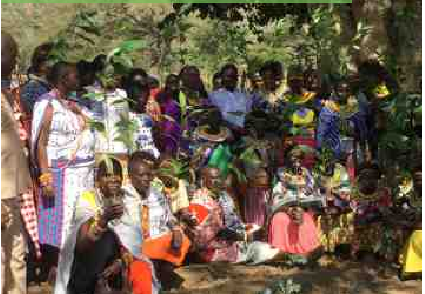
Indigenous women in Kenya planting trees in a community forest.

based diets, would enable us to keep global warming below 1.5°C without dangerous technofixes. [1] As the report points out, a large portion of the remaining global forest estate is still in the hands of Indigenous Peoples and local communities. But, while half of the world's land is associated with a "customary land use" claim, only 10% of those claims enjoy legal recognition. There is clearly much work to be done in recognising and protecting community rights over their customary and traditional lands. Recent research also shows that at least 22% of the total