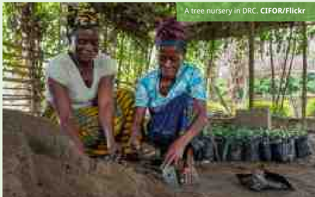
A tree nursery in DRC.

forest peoples' rights, despite the existence of relevant international human rights agreements, some of which have been ratified by DRC. ■