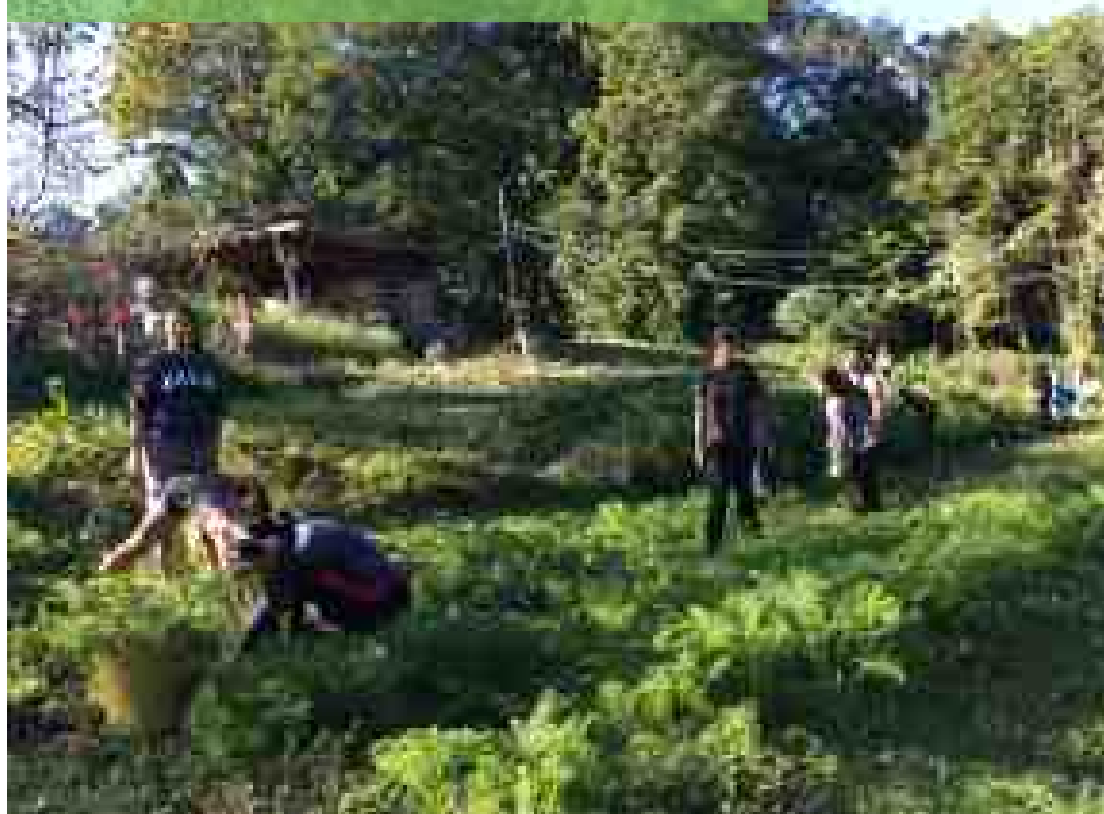
Open work day on the Yale Farm at Yale University. Wanqing Zhou

The 150-people summit was designed to involve activists from as many fronts of the food system as possible, including peasant farmers, organic farm operators, co-op organisers, restaurant owners, chefs, hospitality professionals, food educators including a popular local media platform Food Talk, student groups from Tsinghua and Peking University, promoters of meat alternatives such as the Good Food Institute and Dao Ventures, artists, researchers, nutritionists, environmentalists, and animal welfare experts, from within China and abroad. One specific goal was to encourage educational institutions to adopt a more sustainable food policy, that highlights plant-based diets, and resulting in life-long influence on the younger generation.