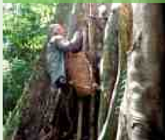
Mengkawago community member harvesting honey.

It is good to see the inclusion of low or no overshoot pathways in the report, since earlier drafts failed to do so. A letter demanding inclusion of no-overshoot pathways was delivered from civil society groups during the drafting stages, and meanwhile some low or no overshoot models/studies were published in the peer reviewed literature. [1]