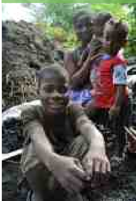
A woman and her children making charcoal in Liberia.

This increasing dependence on charcoal and firewood has both positive and negative impacts on the population. On the positive side, it helps to create short-term jobs, provides cheap energy, and brings in revenue for many families. However, the negative impacts far surpass these short-term economic benefits. Through increased logging, the production of firewood and charcoal is destroying forests on a large-scale, resulting in biodiversity loss and exacerbating climate change.