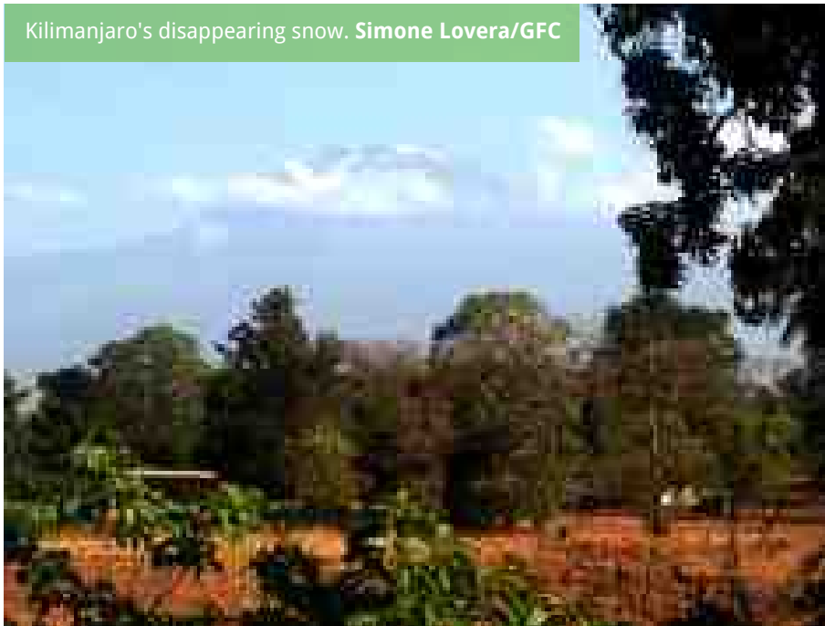
Kilimanjaro's disappearing snow.

So why did the Paris Agreement set a target of 1.5°C if there is convincing scientific evidence that the lives and livelihoods of millions of people, and many forests and other ecosystems, are seriously endangered even if this target is reached? Why has the IPCC invested years of research into the development of pathways to reduce emissions when they basically resemble roads to hell for millions of people? And what assumptions were these pathways based on, if they were not based on the ambition to actually halt dangerous climate change?