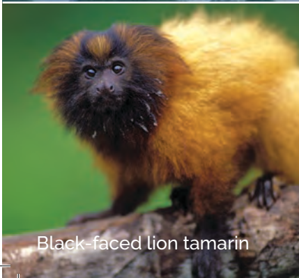
Black-faced lion tamarin