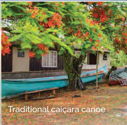
Traditional caiçara canoe