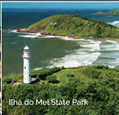
Ilha do Mel State Park