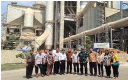
【Waste heat recovery in cement industry】 (Indonesia) 122,000tCO 2 /y. Start operation: Dec. 2017