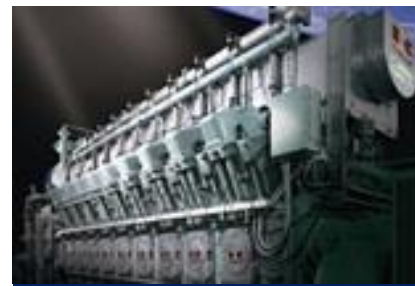
【Co-Generation Plant】 (Thailand) 7,308tCO 2 /y. Start operation Apr. 2018