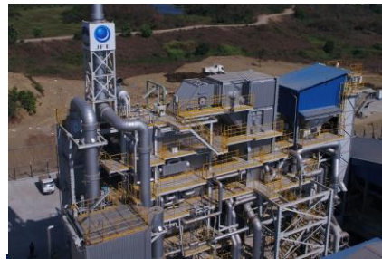
【Waste to Energy plant】 (Myanmar) 4,732tCO 2 /y. Start operation: Apr. 2017