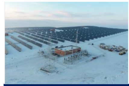
【Solar Power Project】 (Mongolia) 11,221tCO 2 /y. Start operation: Dec. 2016