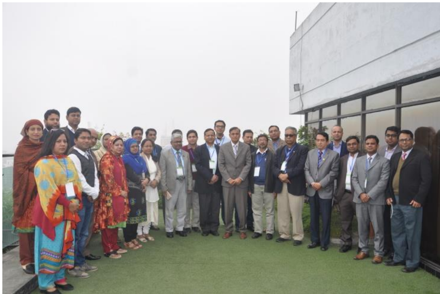
GCF Writeshop 2017