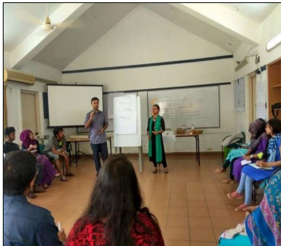
Climate Youth Retreat 2017