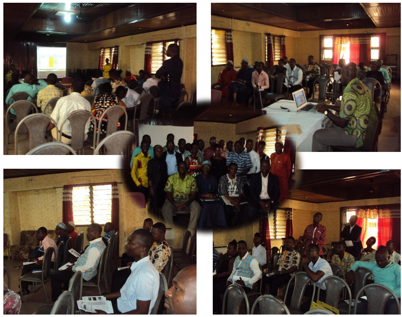
Plate 1: Participants at the stakeholder engagement in ASEM

The stakeholder engagement approach to the strategy development is an important, if not the best mode that guarantees reliable outcomes since the very active players from the various sectors are already involved in developing the strategies. Through this approach, the embodiments of this strategic document are inclusive and well-tailored towards the energy sustainability pathway of the municipality.