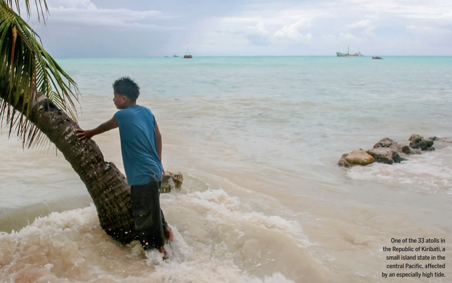
One of the 33 atolls in the Republic of Kiribati, a small island state in the central Pacific, affected by an especially high tide.

erable is strongly determined by social, cultural, and economic determinants and often requires joint subjective and expert deliberation before being submitted to allocating responsibilities. Risk analysis has developed analytical procedures for negotiating and segregating risk according to risk preference (“risk layering”) that have been used in the insurance industry and are being applied to climate risk issues to help allocate risks to multiple actors at various scales (17).